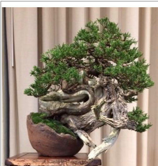
Judge's Award for Best Tree.