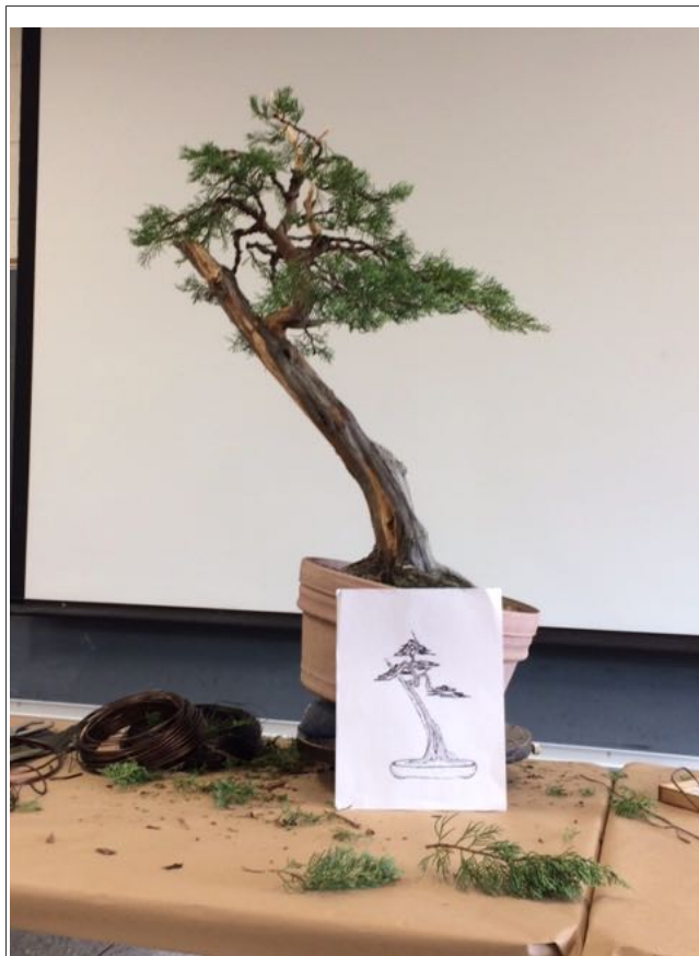
A much improved tree!