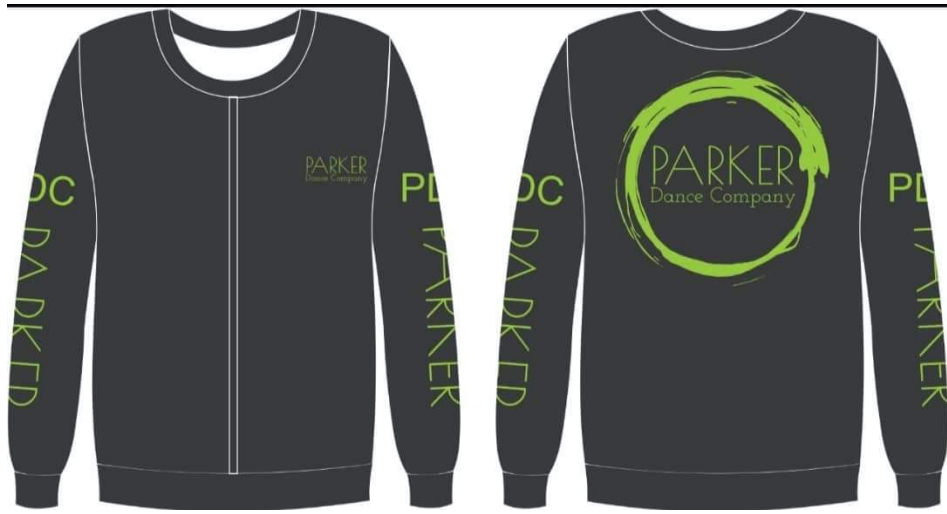
JACKET: Picture of Option TWO.