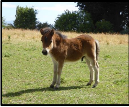
Burravoe Parker: (Pending). Bay Colt Born: 16/11/2019 Sire: Gleneagles Possum Dam: Rockisle Alandia