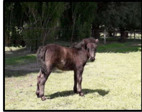
Burravoe Rosalind: (Pending). Black Filly Born: 19/10/2019 Sire: Beechgrove Foxton Dam: Carradale Rose