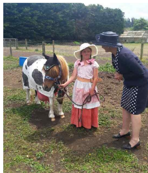
Beechgrove Basil Brush