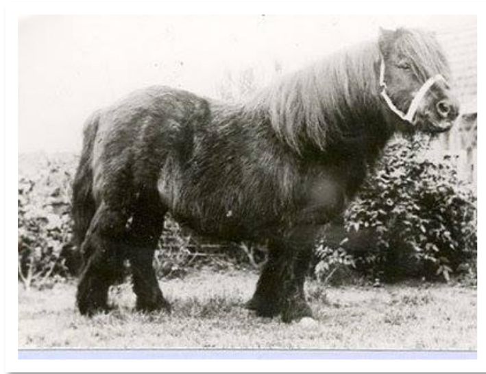
Spear of Marshwood (001675S) - Sire to the first registered Hools Ponies

In 1960 Shona of Lynn (005455M) Sire Majestic of Lynn (001566S), Dam Sunray Girl (005214M), had the 1st registered Hools Shetland Pony foal, a filly - Hope of Hools sired by Spear of Marshwood (001675S) pictured below. He sired the 1st 3 Hools Ponies, Hope in 1960, Harra Broo & Helga of Hools in 1961.