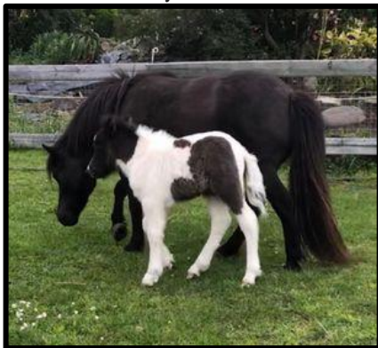
Cotswold Kinross: (Pending). Piebald Colt. Born: 26/9/19. Sire: Cotswold Royal Ensign. Dam: Stoney Croft Monet