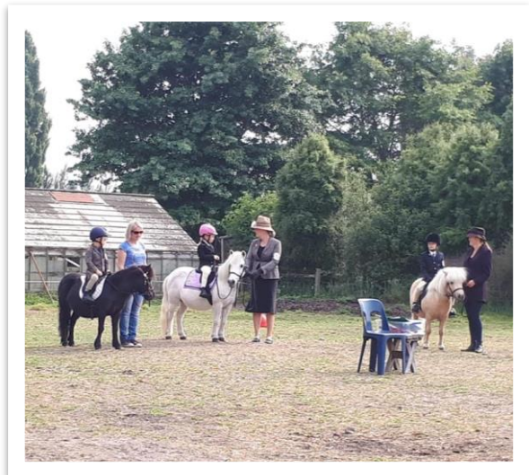
Lead rein competitors.