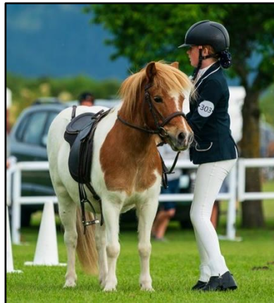
Oops – this ain't supposed to happen during your individual workout! – a tad embarrassing - Cotswold Foxfire Below: Cotswold Brocade