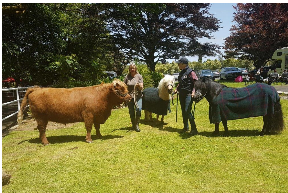
Gleneagles Ebony and Gleneagles Creme de la Creme meeting a Scottish Highland Cow.

An added bonus this year, was that Ebony was decked out in my family Williamson tartan. I have only just recently discovered that my great grandmother (on my father's side) was born in the Shetland Islands. Wow, now I know where my love of Shetland ponies comes from—not just from having been lucky enough to be involved with helping look after a troupe of Shetland beach ponies from age 4—but it is actually in my DNA that I love Shetland Ponies and Highland Cows!!!