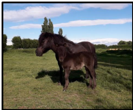
Burravoe Harriet: (Pending). Black Filly