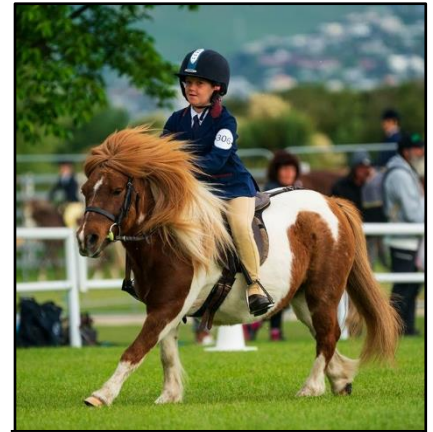
Above: Beechgrove Basil Brush Below: Reserve Champion – Llewellyn Spellbound