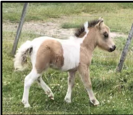
Cotswold Colt Foal Born: 6/12/2019 Sire: Cotswold Dougall McAllister Dam: Cotswold Anastasia