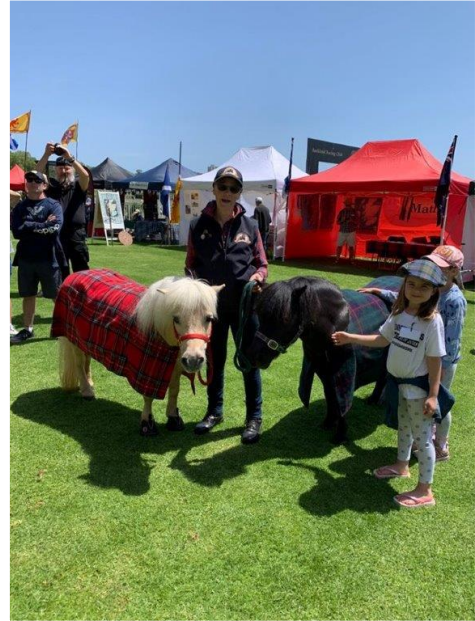
Sateen and Ebony in the main parade of Clans.