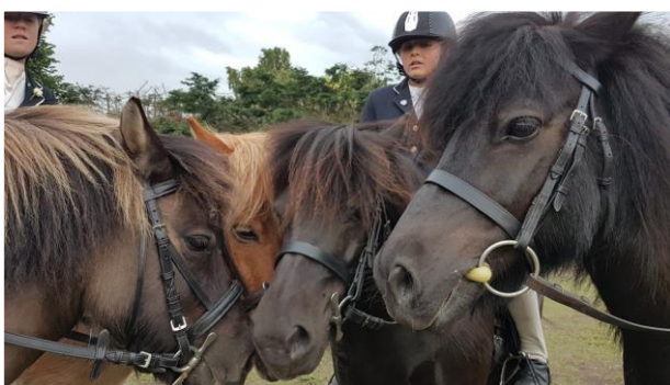
Cuddle time – Cotswold Brocade, Cotswold Foxfire, Llewellyn Melina and Llewellyn Merlin.