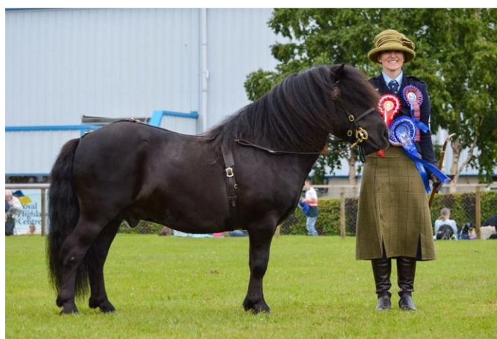
Hools Rising High at the Royal Highland Show

In 2019 at the Shetland Pony Breed Show Hools Rising High was Reserve Overall Ridden & also winning a HOYS qualifier to attend the prestigious Horse of the Year Show in Birmingham.