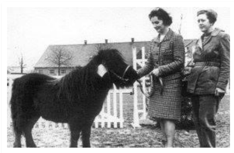
Spaniardson of Hools