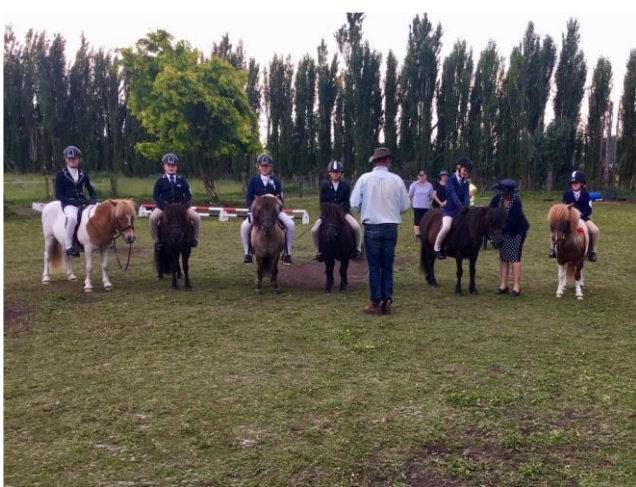
Line up of Ridden competitors receiving their ribbons.