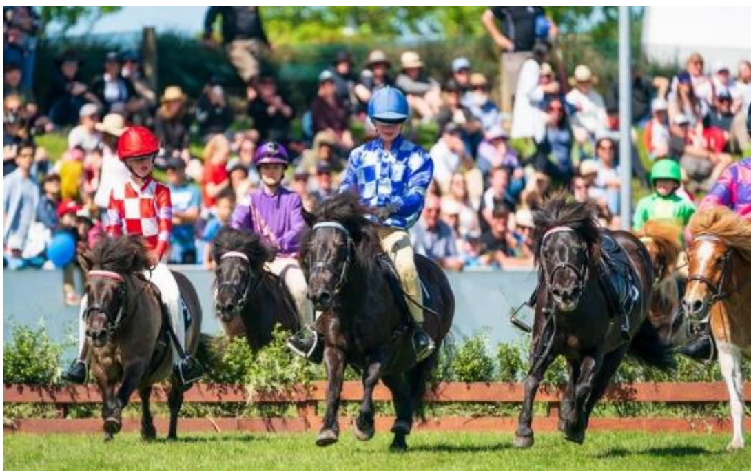
Bee, Merlin, Blue, Ella (still with them), Basil (green) and Foxy