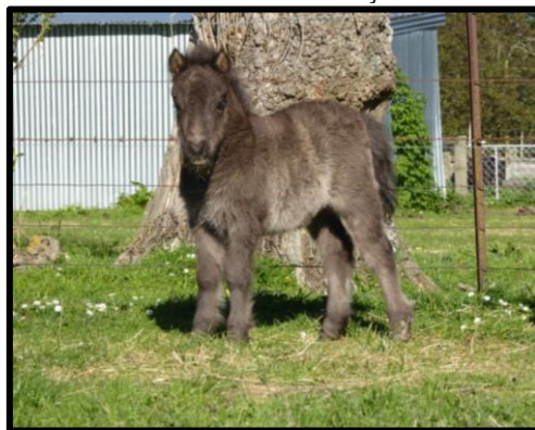
Burravoe Jupiter: (Pending). Brown Colt