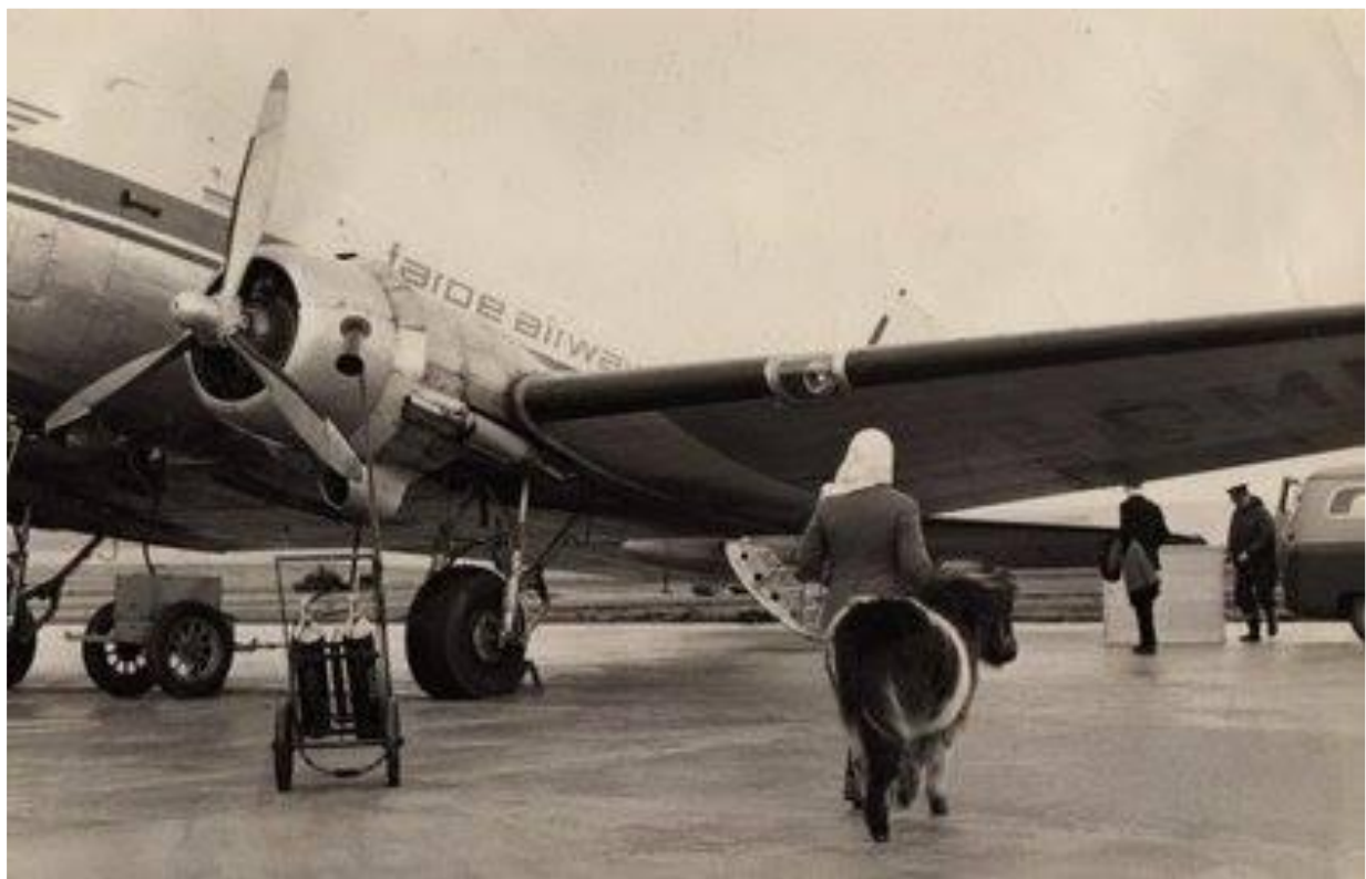
Orkney Wedding of Hools boarding a plane at Kirkwall airport.