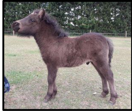
Double H Black Forest: (Pending). Black Colt. Born: 23/09/2019. Sire: Llewellyn Moritz Dam: Shelyron Bramleberry.