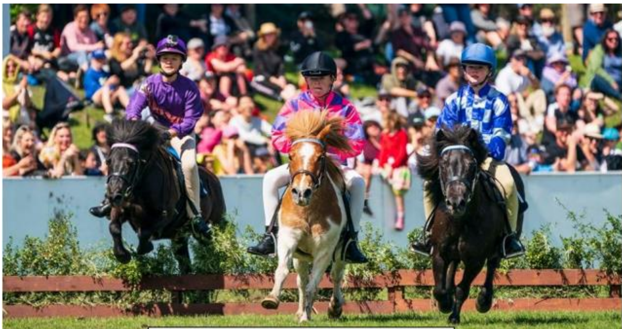
The finish line in sight - Merlin (3 rd ), Foxy (1 st ) and Blue (2 nd )

So, after 8 weeks of training, the race was all over in just a matter of minutes. The training is a huge commitment for parents and riders alike, to come to practices 5 times a week, and well done to them all. Five of the riders were new to the team this year and they were very nervous but did themselves proud. Towards the end of Steeplechase training there were some very tired children. Training continued for a further three weeks for the Shetland Ridden Show.