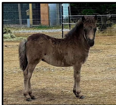
Double H Lavender: (Pending). Black Filly