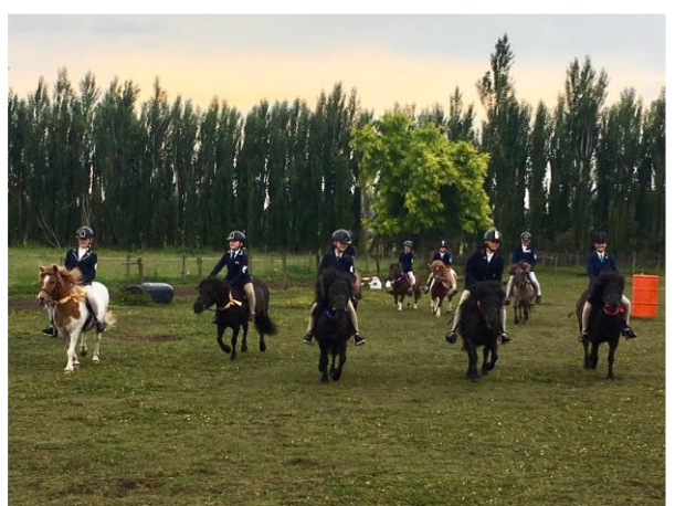
Off they go!