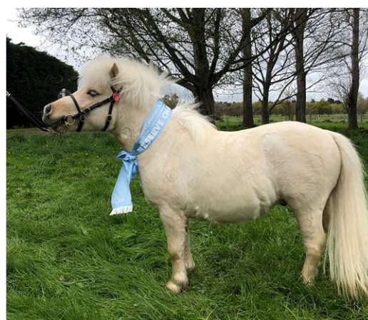
Oaklea Jubilant at Southern Canterbury A&P Equestrian Show. Reserve Champion Youngstock.