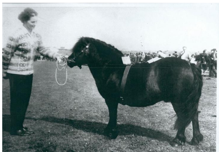
Spainard of Marshwood