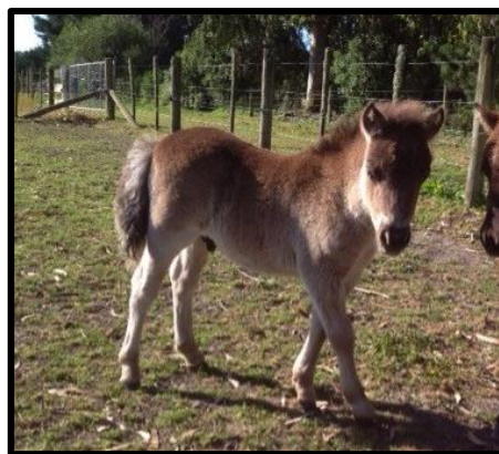
Lael D'Artangan: (pending). Smokey Black Colt.