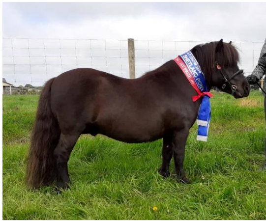
Yeo Lodge Tennessee Top Notch (imp Aus) at Ellesmere A&P Show. Champion Adult.