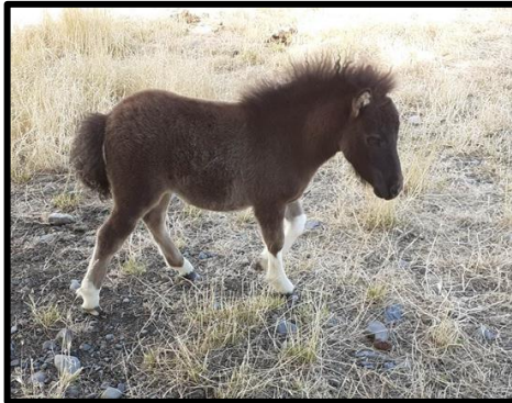
Troughear Park Vauxhaul Reign: (Pending) Black Filly Born: November 2019 Sire: Cotswold Aristocrat Dam: Fair View Maryah