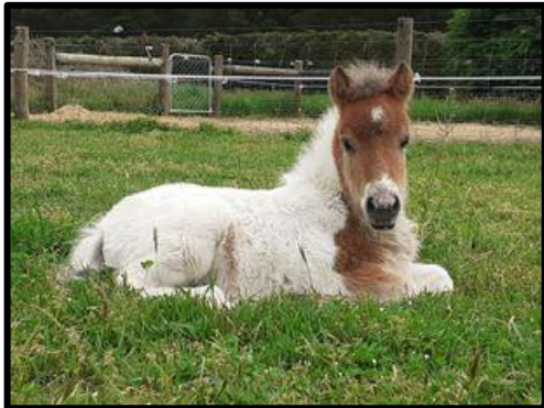
Double H Sparkling Soda: (Pending). Bay Skewbald Colt. Born: 06/10/2019. Sire: Domino Downs Gaiano Dam: Burravoe Phlicka