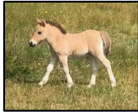
Cotswold Filly Foal Born 18/12/2019 Sire: Cotswold Andross Dam: Fenwick Mariah (imp Aust)