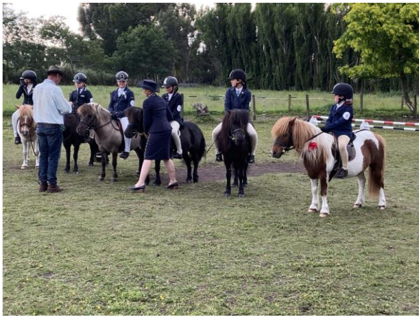
Line up of Ridden Competitors