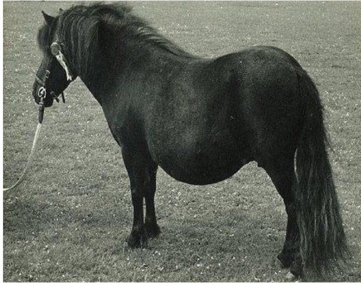
Janet of Marshwood (5568M)