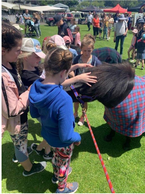
Burravoe Randolph with admiring fans.