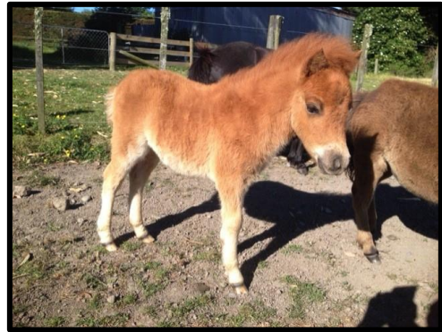
Lael Liberty: (Pending). Chestnut Colt Born: 23/10/2019 Sire: Domino Downs Gaiano Dam: Narrandera Unity