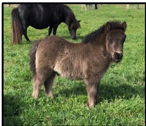
Downton Mr Carson: (Prefix and Name Pending). Black Colt