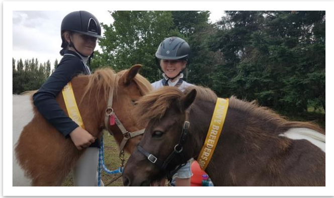
Cotswold Foxfire and Shilmaine Sophia