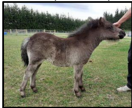
Double H Thistle Rosette: (Pending). Black Filly. Born: 30/09/2019. Sire: Llewellyn Moritz Dam: Duncree Rosemarie