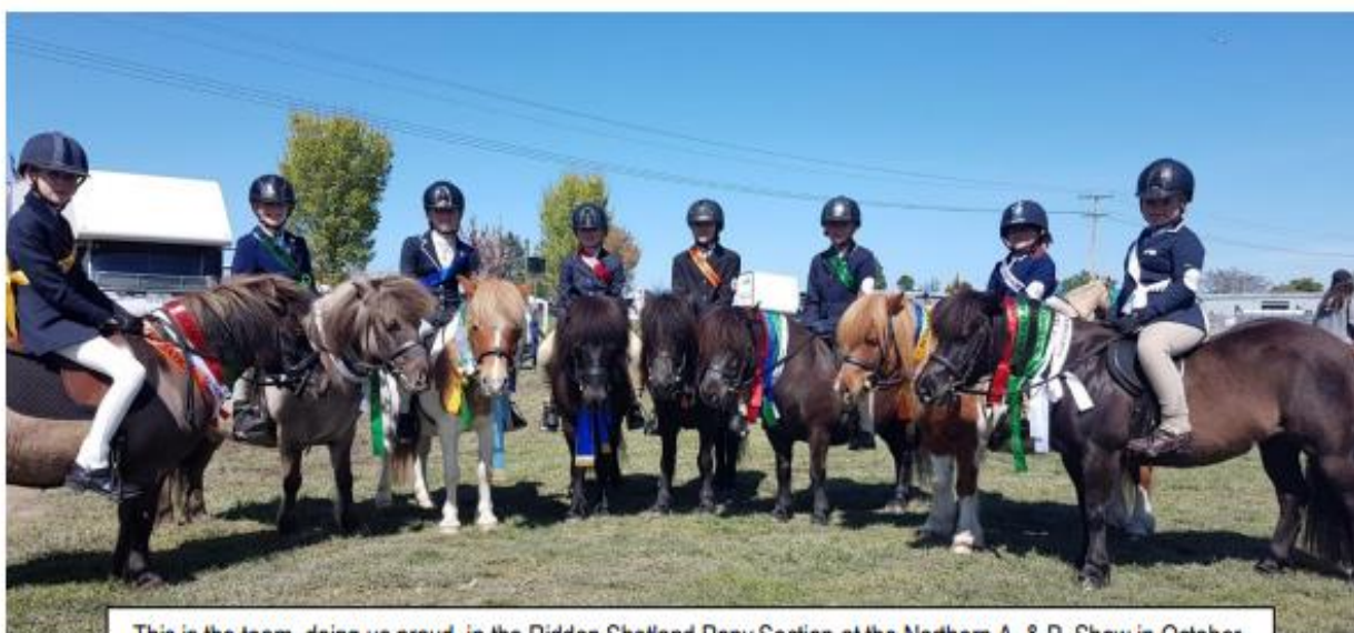
This is the team, doing us proud, in the Ridden Shetland Pony Section at the Northern A. & P. Show in October. Champion – Llewellyn Moody Blue. Reserve Champion: Cotswold Foxfire