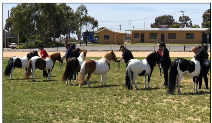
One of the coloured classes.