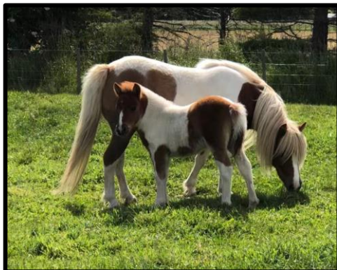
Pictured to Left: Cotswold Filly Foal Born: 25/10/2019 Sire: Cotswold Andross Dam: Cotswold Posey