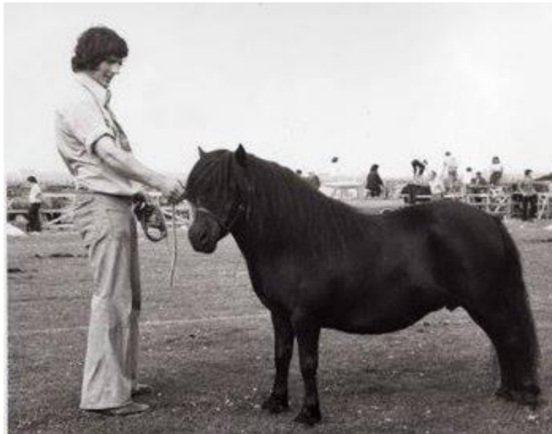
Janey of Hools