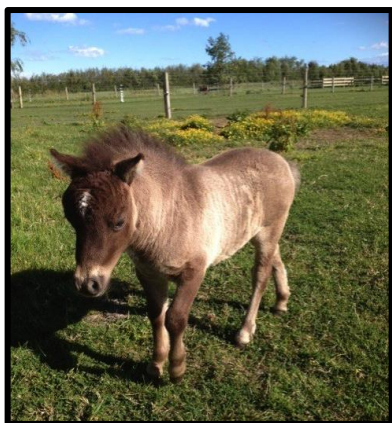
Lael Moon Light Magic: (Pending). Dun Colt.