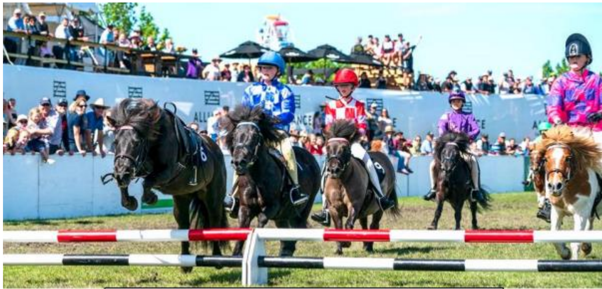
Ella (rider less and in full flight), Blue, Bee, Merlin, Basil (at the back) and Foxy

And, so the race began..... and this picture tells it all