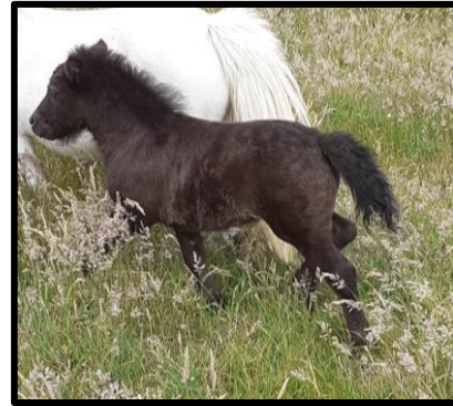
Troughear Park Peppered Havarti: (Pending). Black/Grey Colt. Born: 19/11/2019 Sire: Yeo Lodge Tennessee Top Notch Dam: Cotswold Passion Flower