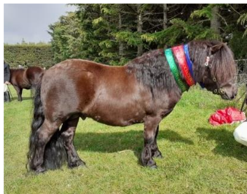
Stoney Croft Noble Legacy at Ellesmere A&P Show.