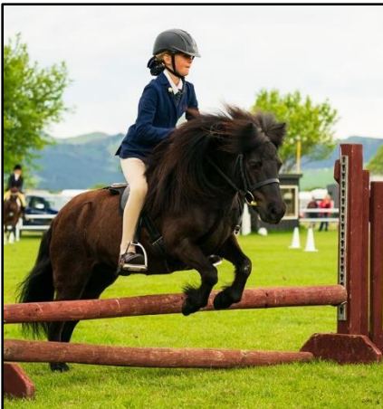
Left: Llewellyn Merlin Bottom Left: The cutest ever Lead Rein combination – Cotswold Alesha Below: part of the chilled out team – Llewellyn Moody Blue, Cotswold Foxfire, Llewellyn Melina and Llewellyn Spellbound