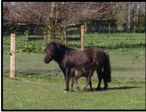
Lael Sundae: (Pending). Black Colt. Born: 22/09/19. Sire: Lael St Nicholas Dam: Murrayfield Custard Pie