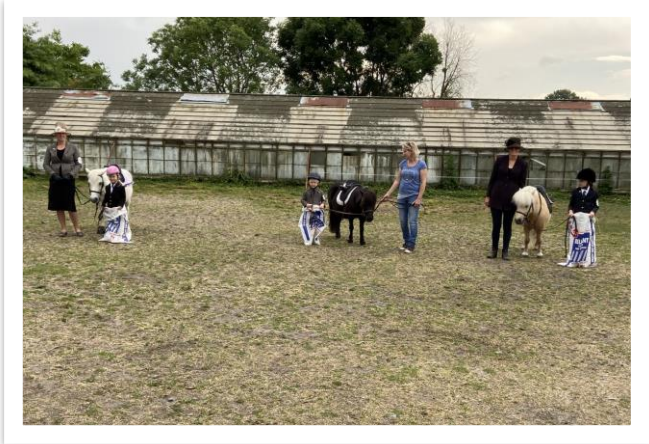
All ready for the sack race to begin.