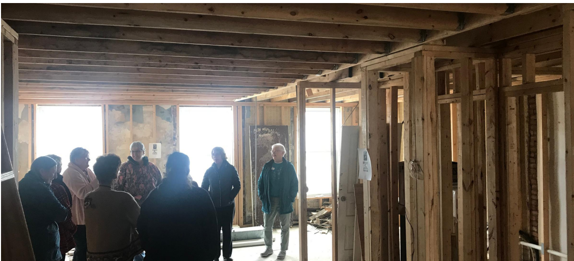
Become a Difference Maker-tour of Phase 2

Soul Sisters would be for women to meet regularly to offer support for all women. It would bring awareness to what we are doing, help those who need help, and engage those who need to be involved.