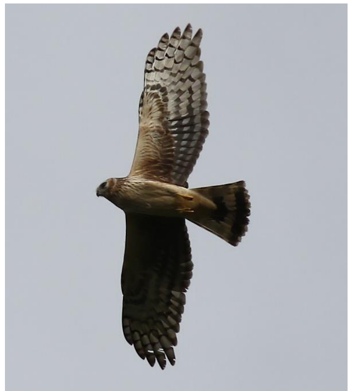
Hen Harrier at Botolph's Bridge