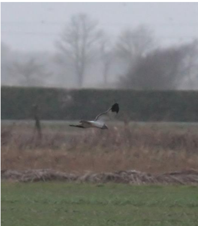
Hen Harrier at Botolph's Bridge