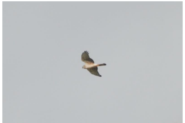
Hen Harrier at Beachborough