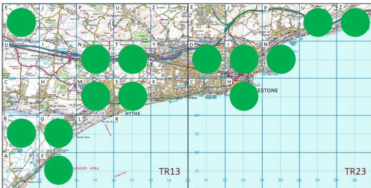
Figure 3: Distribution of all Hen Harrier records at Folkestone and Hythe by tetrad

Figure 3 shows the distribution of records by tetrad.