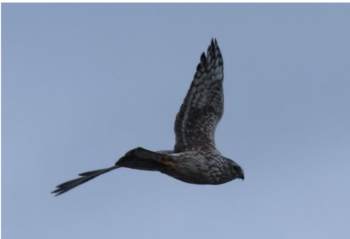
Hen Harrier at Botolph's Bridge

The tetrad map images were produced from the Ordnance Survey Get-a-map service and are reproduced with kind permission of Ordnance Survey .