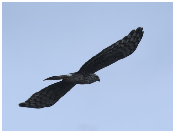
Hen Harrier at Botolph's Bridge