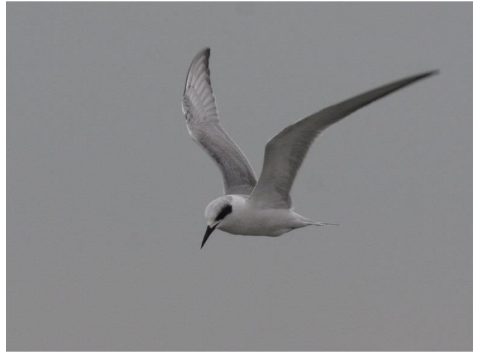
Forster's Tern at Princes Parade (Brian Harper)

Breeds in North America, with two discrete populations, one in the prairies of Canada and the USA which migrates extensively overland towards the Pacific and Gulf of Mexico, and the other along the eastern and southern USA seaboard from Maryland to Texas, with migratory birds following the coasts south. Winters in the southern USA (north to California and Virginia), through Mexico south to Guatemala. It is a rare vagrant to Britain and western Europe.