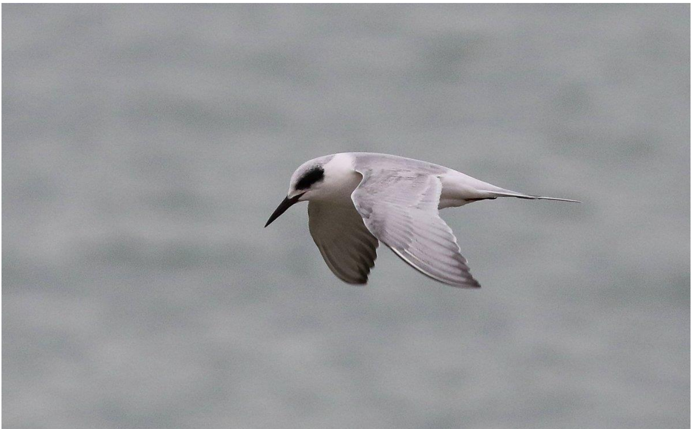
Forster's Tern at Princes Parade (Glenn Honey)

The only area record relates to a first-winter bird found by Ian Roberts at Princes Parade on the 26 th November 2016.