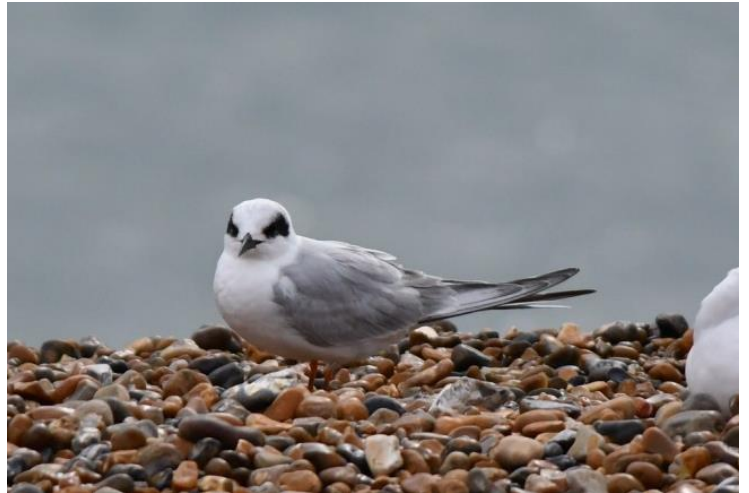
Forster's Tern at Princes Parade (Nigel Webster)