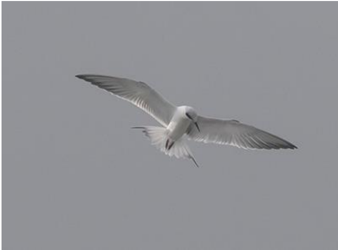
Forster's Tern at Princes Parade