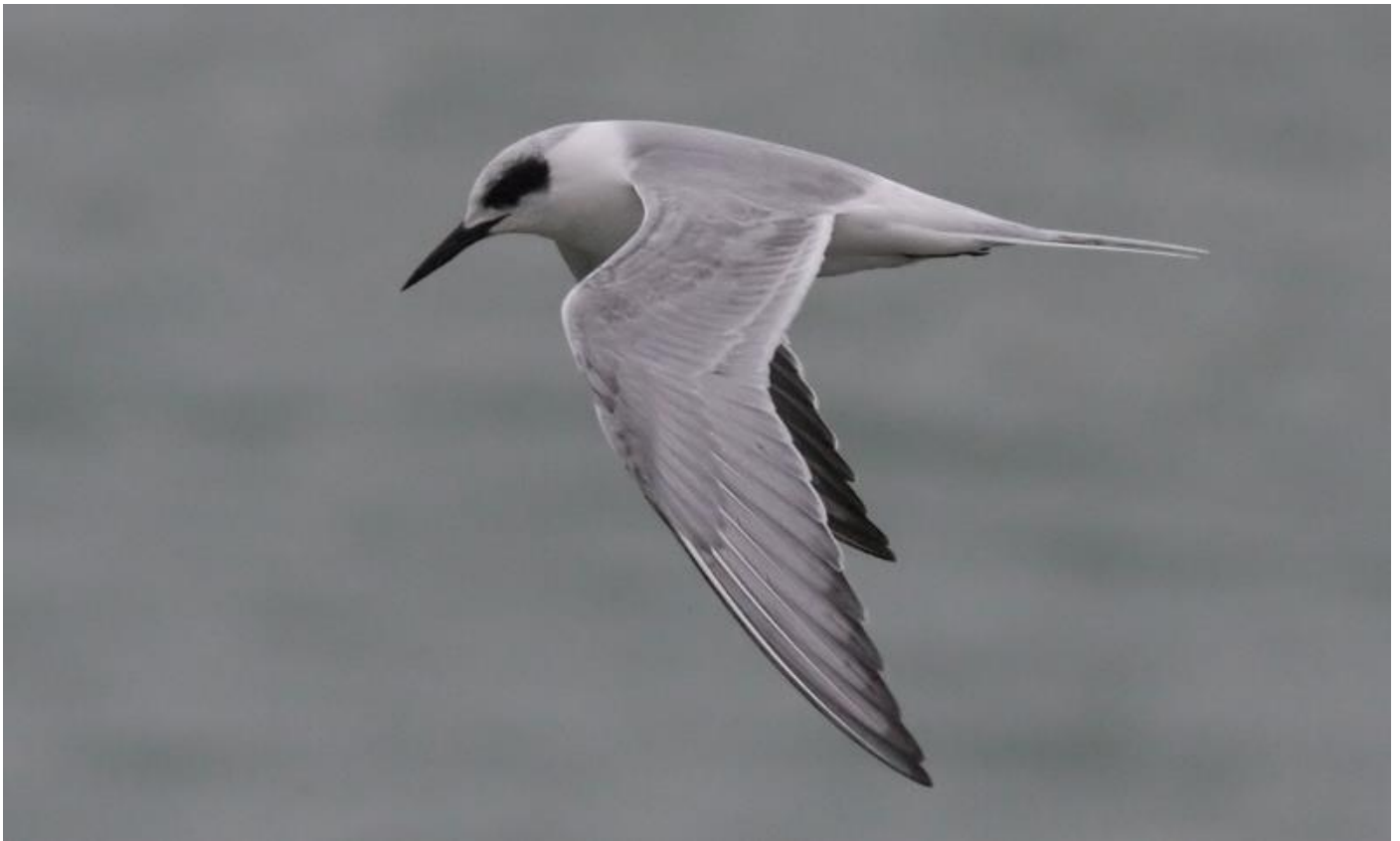
Forster's Tern at Princes Parade