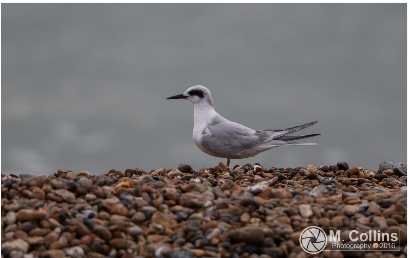
Forster's Tern at Princes Parade (Martin Collins)