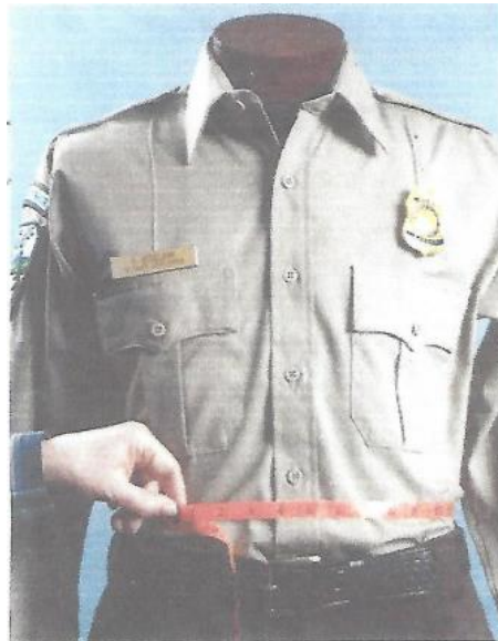
#4: Measure all the way around the widest part of your waist just above your duty belt.