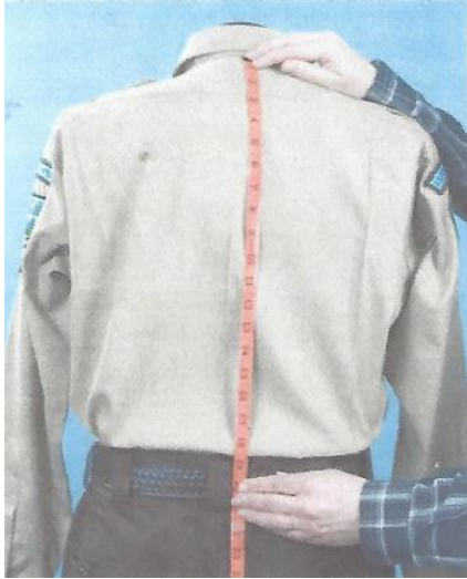
#1: Measure from the base of your collar seam to the top of your duty belt.

Phone: (909) 794-2435 | Fax: (909) 794-4033 | E-mail: bpstactical@aol.com