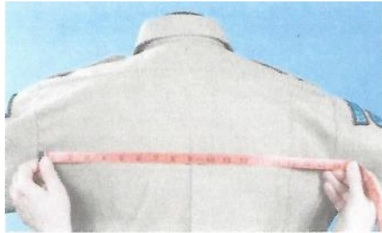
#2: With arms straight out the side, measure from shirt sleeve seam to shirt sleeve seam across the mid-shoulder base.