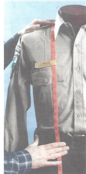
#5: Measure from the center top of the shoulder seam to the top of your belt.