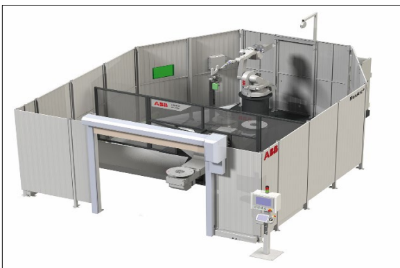
Weld Cell with Automatic Rotating Part Positioner