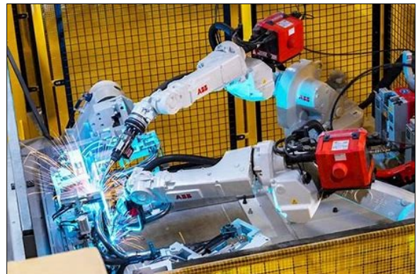
Dual Robotic Weld Cell