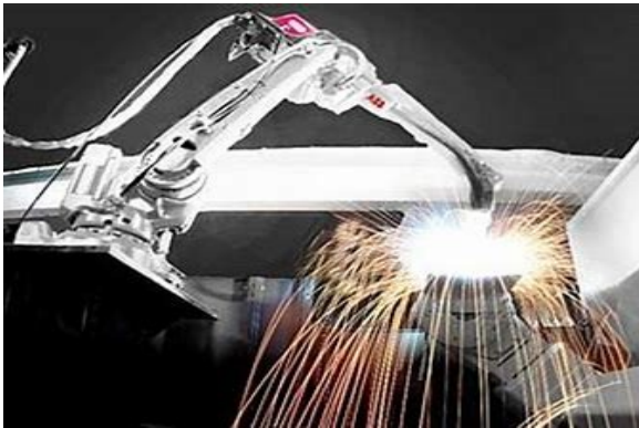
MIG Welding Robot

We would be pleased to work with you and your team to discover where our welding domain expertise may be of beneficial service to your company. We also have the expertise to automate up and down stream processes like assembly, grinding, polishing and material handling. Please give us a call at 941.351.6330.