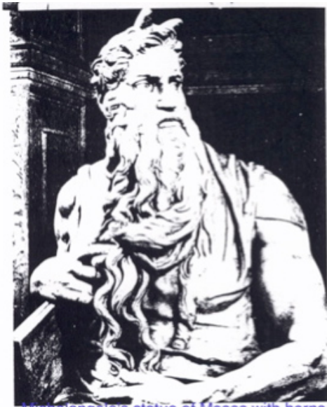
Michelangelo's statue of Moses with horns at St. Peter's Basilica

There is a statue of Moses in St. Peter's Basilica, the supposed great Roman Catholic church of Rome that has horns on it. Can you even imagine the audacity, the abomination. How is it possible for any Roman Catholic person with half a brain to accept this kind of demonic idolatry right in their supposed Mother Church? Imagine how hard it must be for a follower of Rome to see this and continue to follow such a pagan religion.