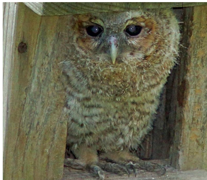
Tawny Owl at Newington (Garry Blackburn)

In Kent it is a widespread but under-recorded breeding species.