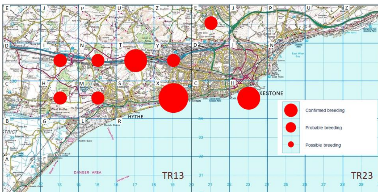
Figure 1: Breeding distribution of Tawny Owl at Folkestone and Hythe by tetrad (2007-13 BTO/KOS Atlas)

Figure 1 shows the breeding distribution by tetrad based on the results of the 2007-13 BTO/KOS atlas fieldwork.