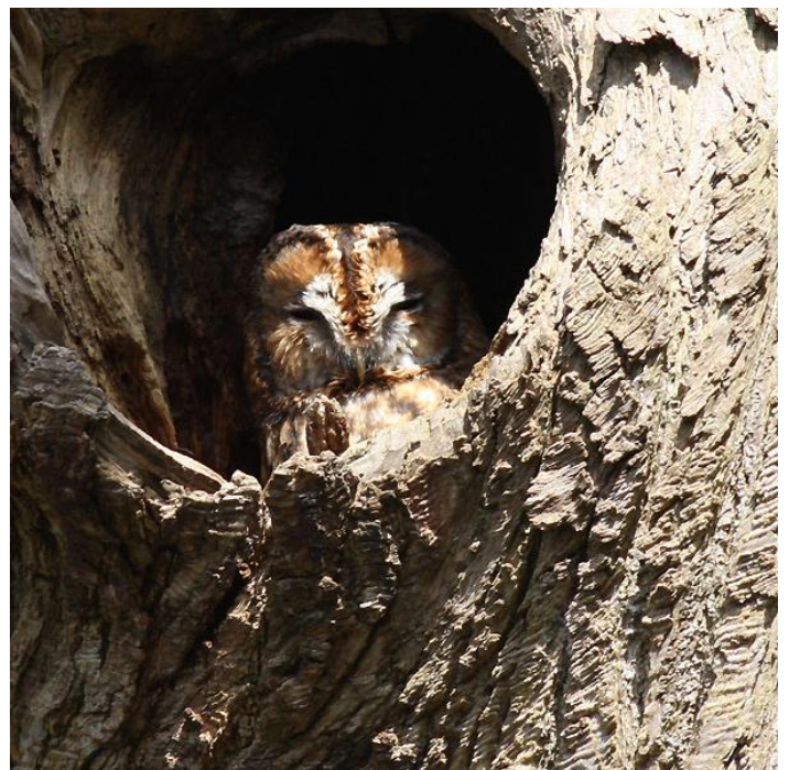
Tawny Owl at Hythe