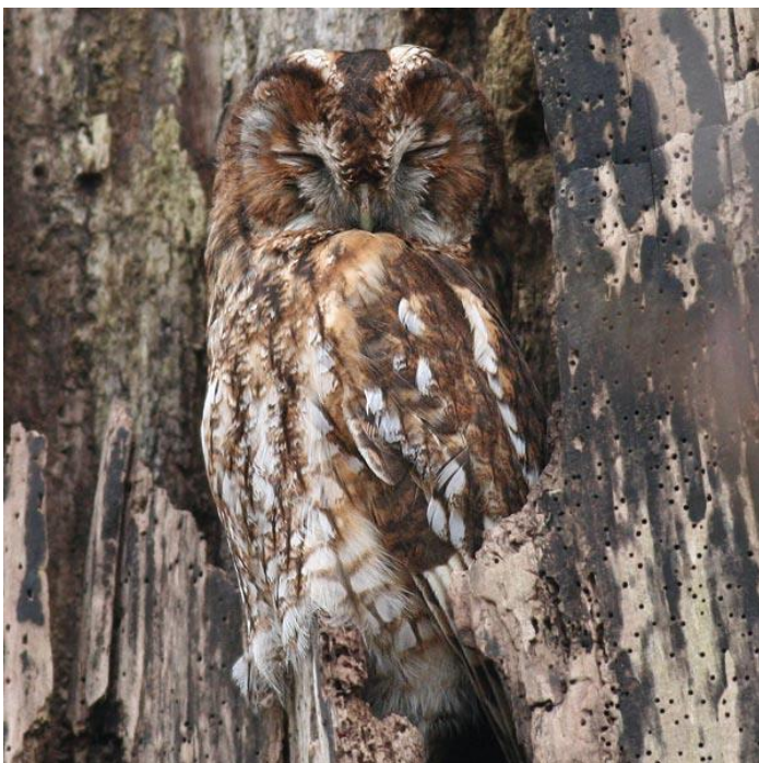
Tawny Owl at Saltwood Castle (Brian Harper)

It has been recorded from just about all tetrads with any area of mature trees, in rural and urban areas, and is probably only genuinely absent from the open areas of marshland (TR13 A, B and F) and shingle (TR13 L and R). Improved nocturnal coverage of the other tetrads would probably complete at least some of the gaps.