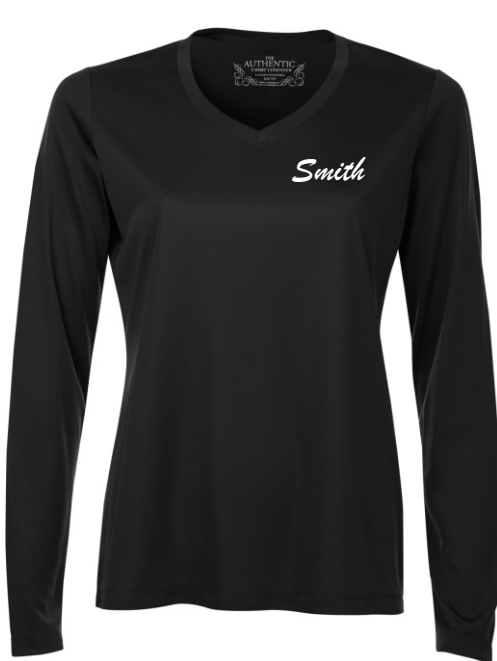
Ladies' V-Neck Front