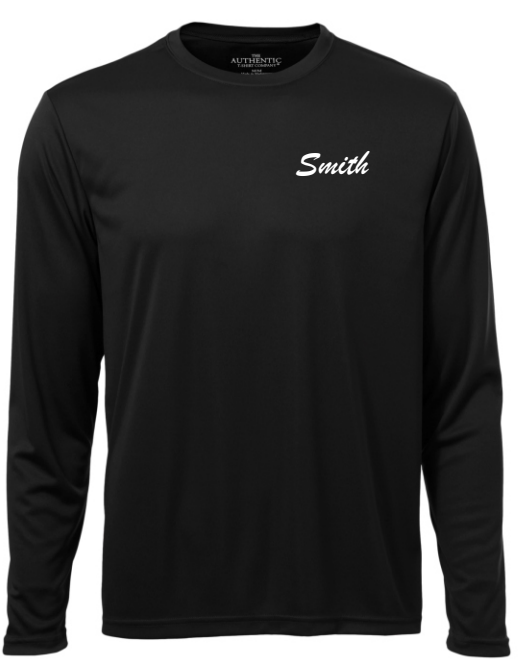
Adult and Youth Crew Neck Front

Add Personalized Printed Name on Front Left Chest - $5.00 + tax