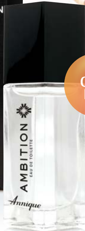
Ambition EDT 30ml AF/50103/16