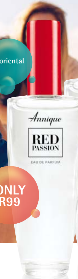
Red Passion EDP 30ml AF/10400/17