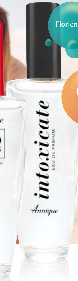
Intoxicate EDP 30ml AF/10308/17