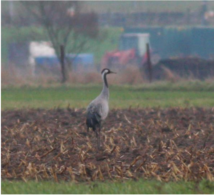
Crane at the Willop Basin