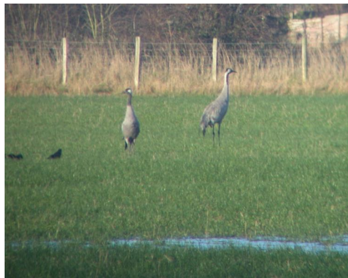
Cranes at Lower Wall Road (Ian Roberts)

There has been a strong increase in the British population in recent years, partly fuelled by reintroductions in south-west England, although in the last three years the population has stabilised at around 35 pairs.