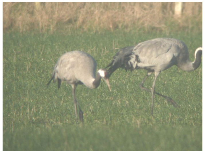
Cranes at Lower Wall Road (Dale Gibson)