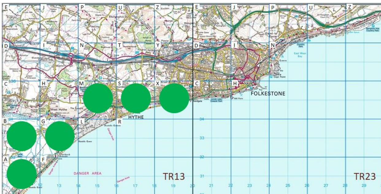
Figure 3: Distribution of all Crane records at Folkestone and Hythe by tetrad

Figure 3 shows the distribution of records by tetrad.