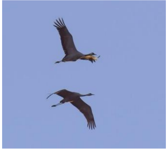
Cranes over Folkestone