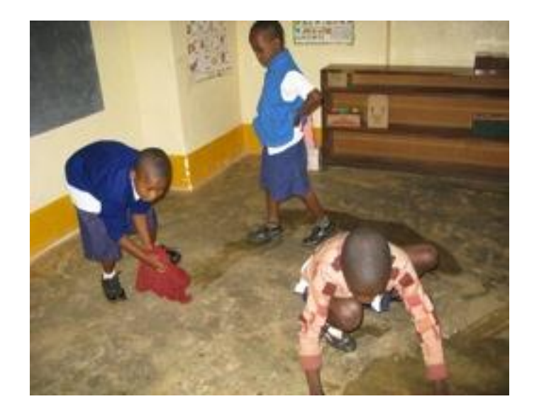
Figure 1 . Boys in the Youngest Class Cleaning Their Classroom

through education of the students and the community is to dispel these misconceptions. A parent discussed the positive changes in her children's self-care skills since attending Rainbow: