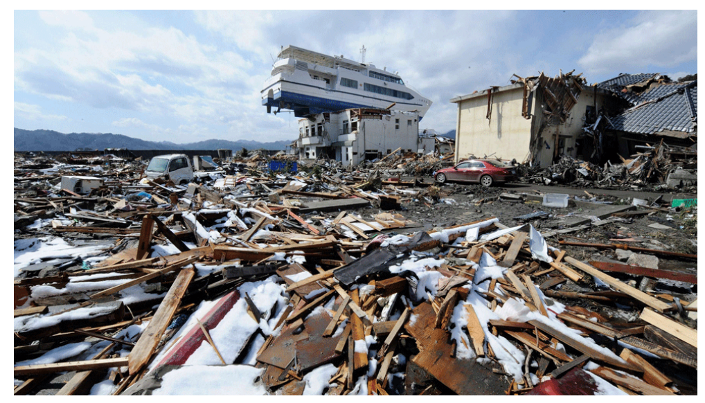
Should that boat really be there?