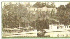
The Helen & The Wanakena in front of the Hotel Wanakena

Before more of Wanakena's precious history is lost, now is the time to go through those boxes in the attic or dresser drawers. Although the WHA has an impressive collection, we just don't know what we don't know! In other words, let us know those special stories about your grandparents, or your own! Send us a letter about why Wanakena is special to you, or how you or one of your relatives helped shape the community into what it is today!