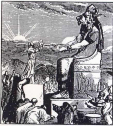
Baby being offered to the heathen god Molech

of Christianity. Because many of these places continue the pagan rituals and worship of old, the baptism and dedication of children and adults there is nothing more than heathen baptism, and dedication to the gods of the pagan religions, under the covering of a so-called Bible Believing church of Yahveh. Anyone baptized in one of these organizations commonly called Christian churches, need repent and renounce such a practice by a pagan religion. The mikvah/baptism is a holy ceremony of great importance in the life of a Believer and must be done in reverence to the only true God, Adonai, the Holy one of Israel, in the name of His Son, Yeshua.