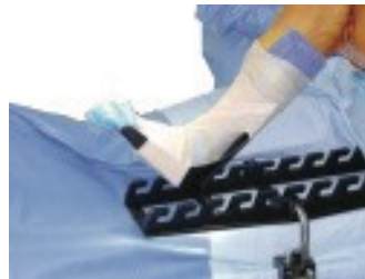
DSC-2630 Robb Leg/Knee Positioner Steam & Gas Sterilizable Aluminum Footplate Includes 3 Disposable Sterile Pads