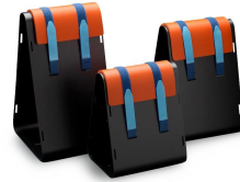
DSC-2760-00 Fromm Knee Triangles (XS Shown is Sold Separately) Set of 3