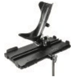
DSC-2620 Stulberg Leg/Knee Positioner Aluminum Footplate Includes 3 Disposable Sterile Pads