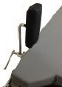
DSC-SP Stress Post & Pad (Requires 1 Clark Socket)