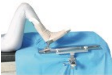
DSC-800-0141 (24" base) DSC-800-0171 (30" base) Total Knee Positioner Smooth Motion, Locks in Position Autoclavable