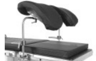
BD170 Knee Crutch Supports (Requires 2 Clark Sockets BD-CS) Pair