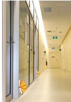
Rooms Searched and Evacuated