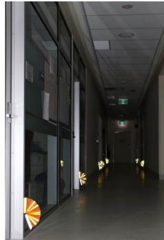
Highly Visible in Torch Light

The EvacFlag™ streamlines a current chaotic process, reducing the risk of anyone being missed in a search.