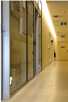
Rooms Not Searched