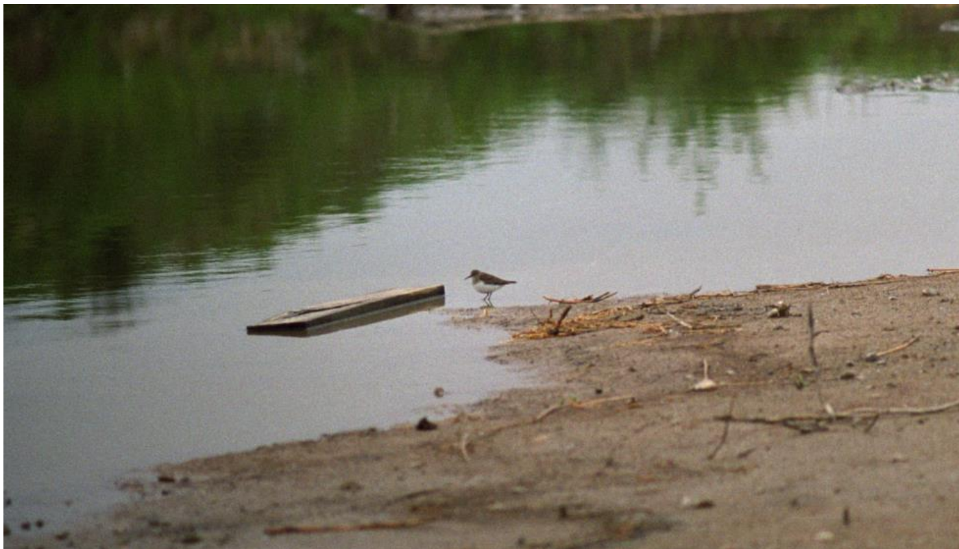
Temminck's Stint at Nickolls Quarry

The tetrad map images were produced from the Ordnance Survey Get-a-map service and are reproduced with kind permission of Ordnance Survey .