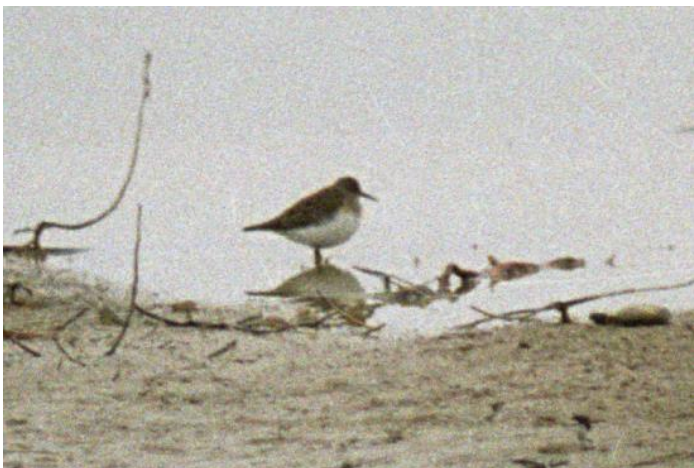
Temminck's Stint at Nickolls Quarry