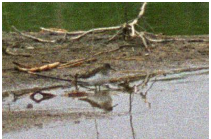
Temminck's Stint at Nickolls Quarry