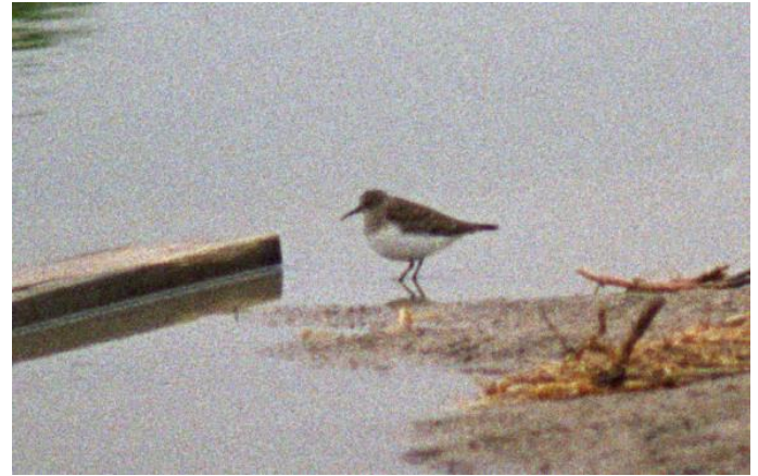
Temminck's Stint at Nickolls Quarry (Ian Roberts)

In Kent it is a scarce but regular passage migrant both spring and autumn (KOS, 2020).