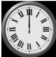
Return of the King End of time