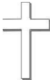
Kingdom Of God On Earth