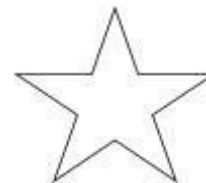
Establishing of Kingdom of God in its final visible form

Extended by----->Man----->Israel---->The Church ----->