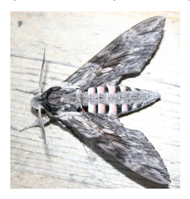
Convolvulus Hawk-moth - Hythe - 14th September

Convolvulus Hawk-moth was yet another migrant recorded in good numbers in 2006, with 3 in Folkestone Warren on the 13<sup>th</sup> September, one at Hythe the next night (photo), one at Folkestone on the 18<sup>th</sup> September (photo) and another at Samphire Hoe in late September.