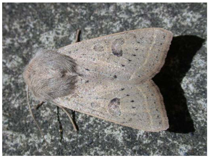
Chocolate-tip - Hythe - 21<sup>st</sup> April