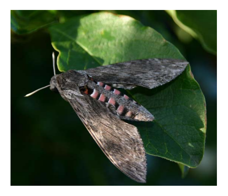
Convolvulus Hawk-moth - Folkestone - 18th September