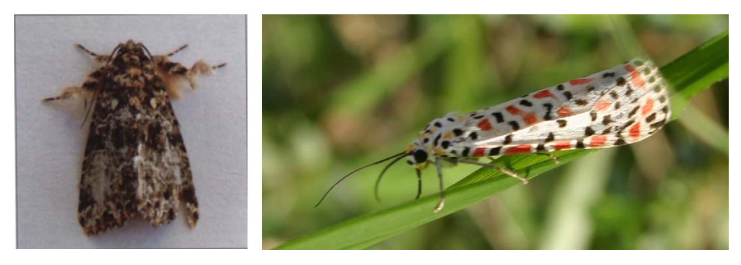
Methorasa latreillei - Samphire Hoe - 27th October