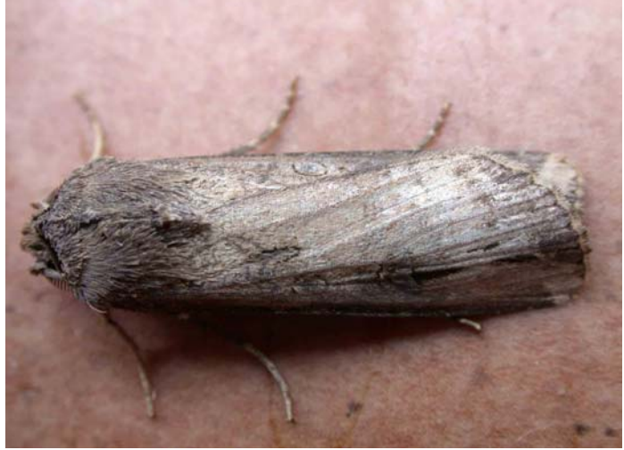
Clancy's Rustic - Hythe - 9th October