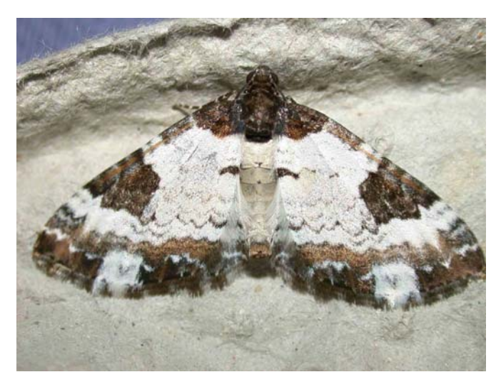
Pretty Chalk Carpet - Hythe - 6th May

A Netted Pug was taken at Folkestone on 2nd June (photo) and 3 Freyer's Pugs were at Hythe between 28th May and 19th June. Cypress Pug continues its expansion, with 2 at Folkestone on the 2nd June and 3 at Hythe between the 23rd August and 8th September. Green Pugs were present in good numbers, with a peak of 17 at Hythe on 19th June.