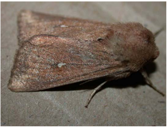
Dew Moth - Abbotscliffe - June