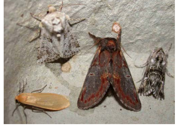
Lime, Small Elephant and 2 Elephant Hawk-moths - Folkestone - 22nd June