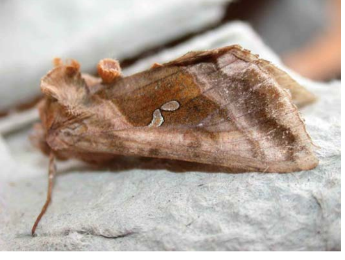
Feathered Brindle - Hythe - 21st September