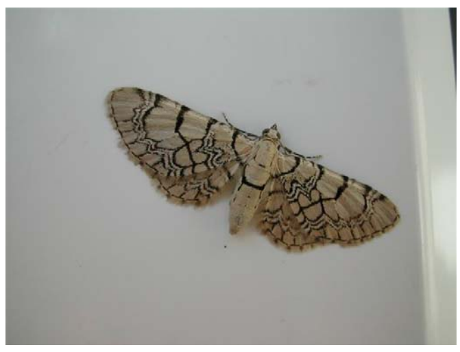
Netted Pug - Folkestone - 2nd June

There were two Small Yellow Waves at Hythe in July, and a Bordered Beauty there on 4th September. Singles of Lilac Beauty and Orange Moth were trapped in Folkestone Warren on 16th July. A Pale Brindled Beauty was taken in Folkestone on 17th March, with a Brindled Beauty in Hythe on 11th April (photo). A Straw Belle was at Samphire Hoe on the 8th July (photo).