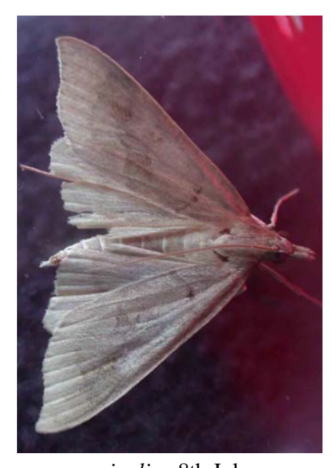
asinalis - 8th July

A single Dolicharthria punctalis was at Hythe on 9th July, but there were no records of the other shingle-dwelling species caught there last year ( dentalis and boisduvaliella ). There were 5 extimalis at Hythe between 13th July and 5th September, and 4 nubilalis (European Corn-borer) there between 17th June and 1st July.