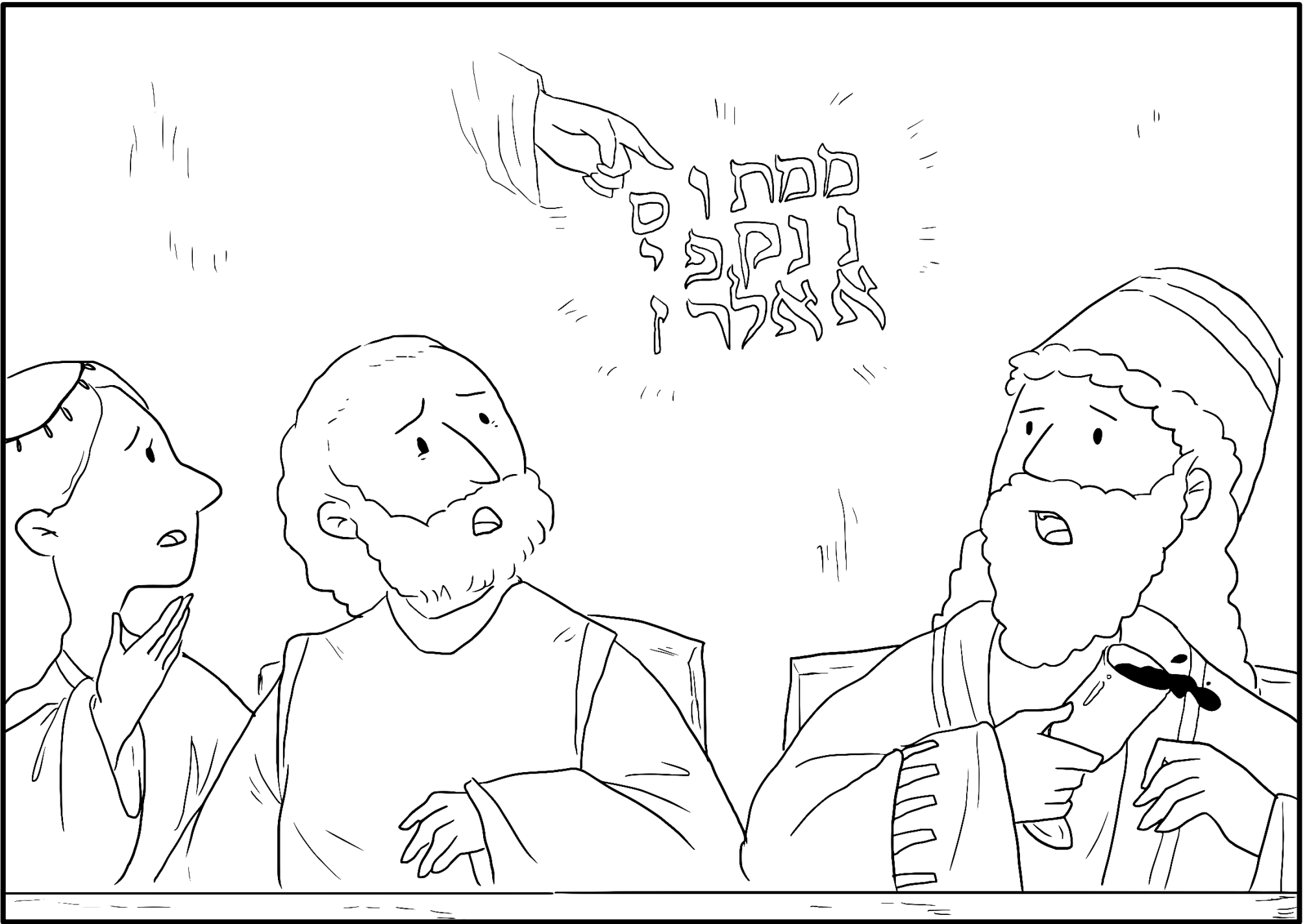
At that moment fingers of a man's hand came out and wrote on the plaster of the wall of the king's palace across from the lampstand. And the king saw the part of the hand that wrote Daniel 1:5