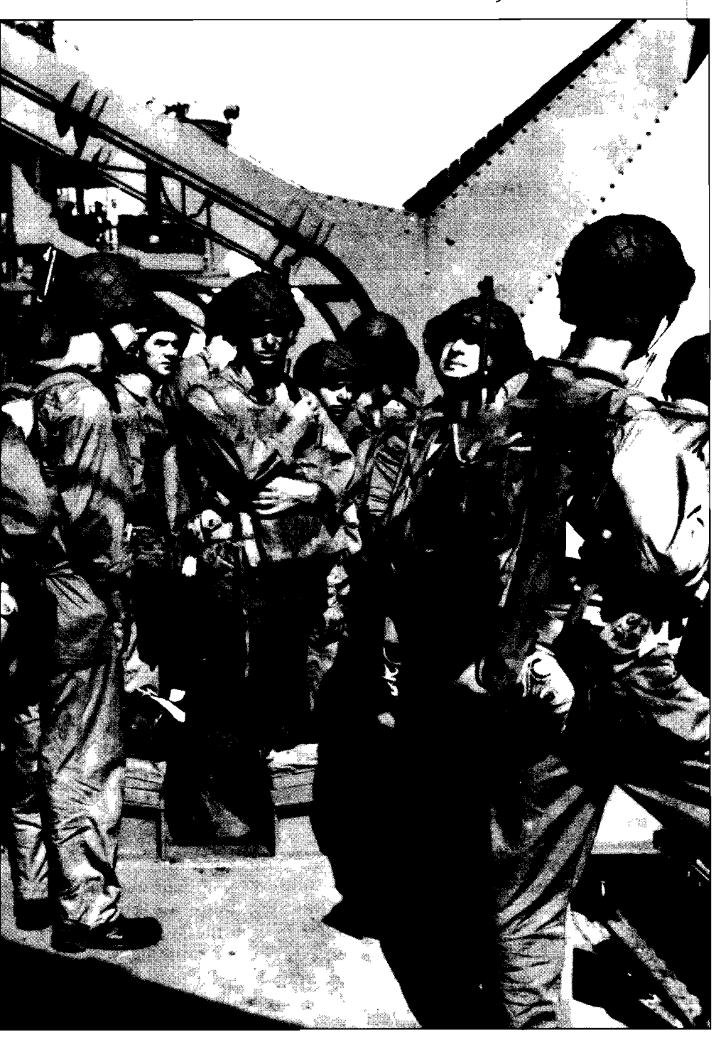
Landing parties were deployed from Coast Guard-manned Navy transports during the amphibious invasions of the war in the Pacific.

Both sides considered Guadalcanal to be vital. Guadalcanal was a rugged, inhospitable island in a strategically important position. Japan had taken the island from Great Britain earlier in the year. The airfields that the Japanese were building would threaten the Allied New Hebrides and New Caledonia. The Japanese could