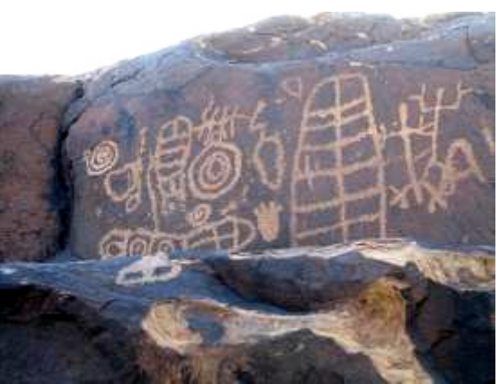
The "Creation Panel"