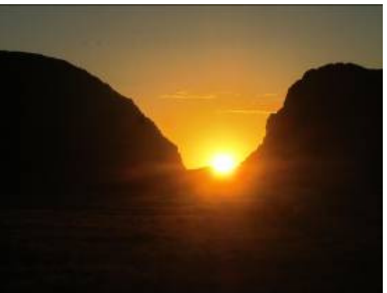
The sunset at the Gap – June 22, 2013

The sunset at the Gap never gets old. It was a great way to end a long day.