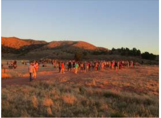
Crowd watching the sunset