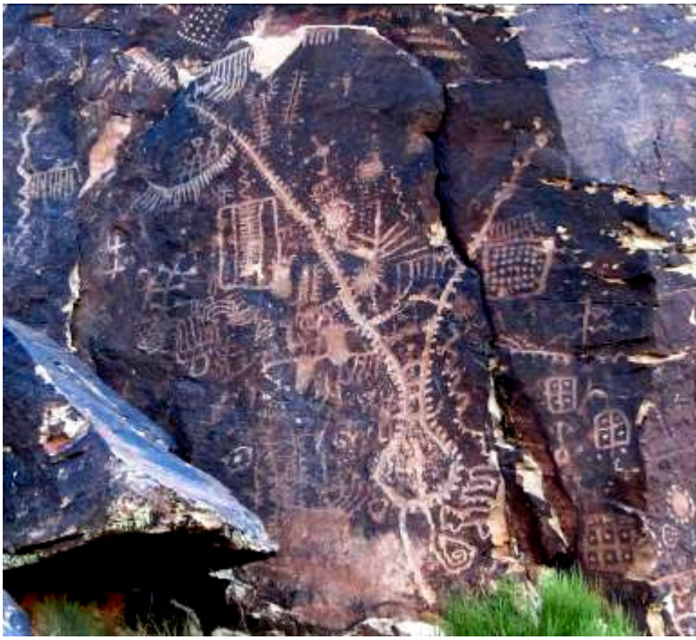
The "Zipper Glyph"

One of the largest crowds in recent times, over 300 people, were present to hear Nal Morris describe the "Zipper Glyph" and to view the sunset.