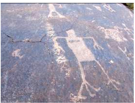
Light arrives on the Bird Shaman