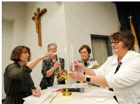
Installation of HDCCW Officers for 2022-2024 (shown from R-L)