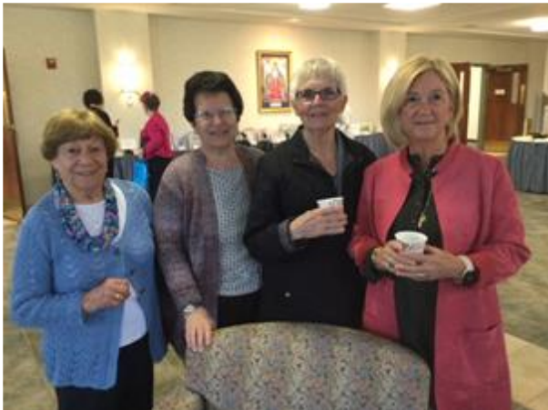
Delegates from Seven Sorrows Parish