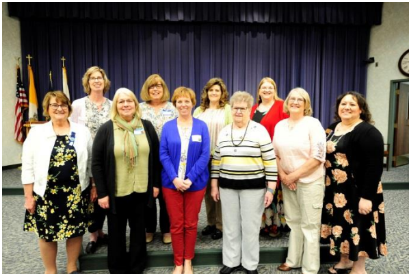
First time attendees

Additional convention photos can be found on our website.