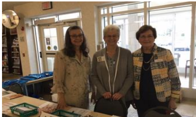
Conewago District ladies assist at Registration

SAVE THE DATE April 16, 2023 97th Annual Convention Diocesan Center Harrisburg