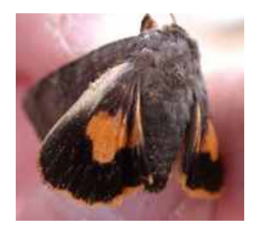
Langmaid's Yellow Underwings – Hythe – early August 2004

There were four records of Hummingbird Hawk-moth in 2004 - singles in the Golden Valley area of Folkestone on the 6th July, in eastern Folkestone and at Samphire Hoe in late August, and at Samphire Hoe in mid-October. Dark Swordgrass were recorded at Hythe on 4 dates between 29th/30th June and 4th/5th September. Silver Ys were recorded between 5th/6th June and 7th/8th November but in modest numbers apart from a distinct peak in the first half of August, which included a count of 19 at light at Folkestone on the 10th/11th.