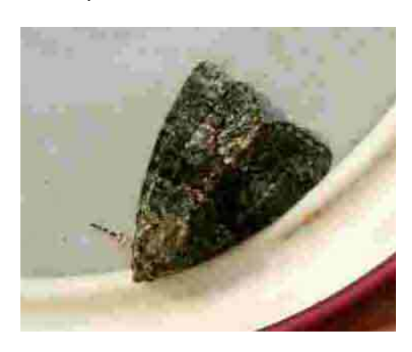
Tree-lichen Beauty – Folkestone – 3rd/4th August