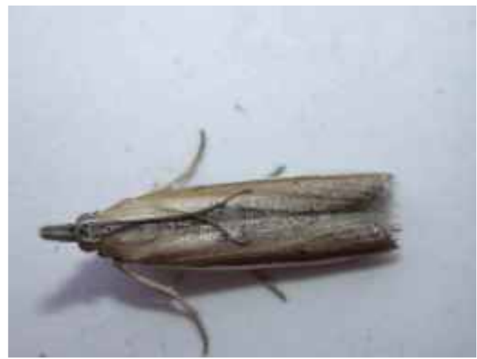
boisduvaliella - Hythe - 29th/30th July (above & below)