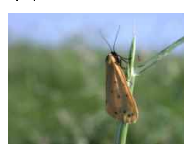
Dew Moth - Abbotscliffe

A Cream-spot Tiger was trapped at Samphire Hoe on 4th/5th June. Whilst day-flying Cinnabar are common, one attracted to light at Hythe on 9th/10th June was more unusual. Three Kent Black Arches were recorded in early August – one at Folkestone on the3rd/4th and two at Hythe on the 6th/7th. A White-line Dart was taken at Hythe on the 16th/17th July and a Light Feathered Rustic was a notable record at Hythe on the 19th/20th May (photo). A Gothic was recorded at Hythe on 16th/17th July.