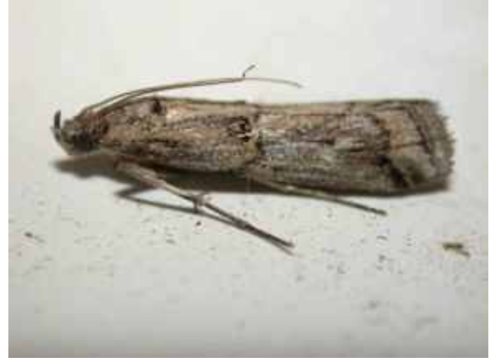
Dolicharthria punctalis - Hythe - 27th/28th June