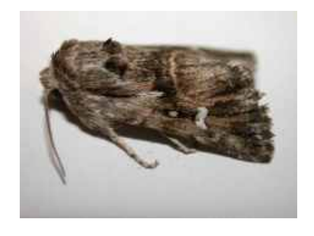
Toadflax Brocade – Hythe – 3rd/4th August

A count of 17 Feathered Ranunculus at Hythe on 26th/27th September was a notable one, and single Large Ranunculus were at Hythe on 28th/29th September and 4th/5th October. A Bird's Wing was taken at Hythe on 15th/16th June. A presumed Ear Moth at Hythe on 28th/29th August was rather late.