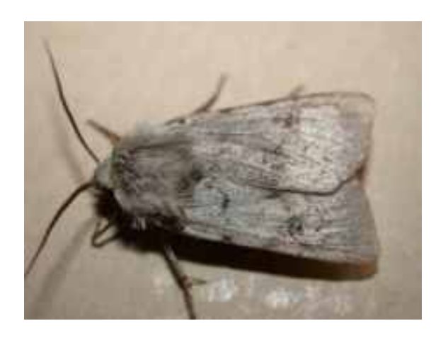
Light Feathered Rustic – Hythe – 19th/20th May

A Pale-shouldered Brocade at Hythe on 12th/13th August was rather late, and a Broad-barred White there on 14th/15th May was notably early. A Tawny Shears at Hythe on 1st/2nd May was noteworthy. The first Common Quaker was at Hythe on 16th/17th March and a count of 20 there on 16th/17th April was notable. The first macro of the year was a Hebrew Character at Hythe on the 4th/5th March. Single Toadflax Brocades were notable records at Hythe and Folkestone in early August (photo).