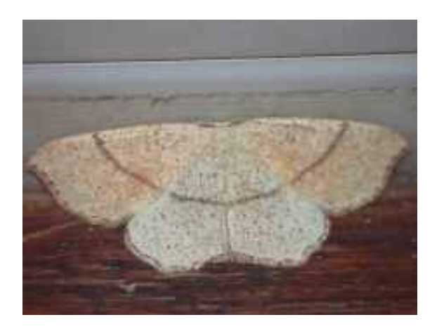
Maiden's Blush – Hythe – 26th/27th May

Least Carpets were noted at Hythe on 16th/17th June (photo) and 21st/22nd July (2). In April singles of Shoulder Stripe and Streamer were caught in Folkestone on 26th/27th and 22nd/23rd respectively. A Spruce Carpet at Hythe on 16th/17th May was notable. A single November Moth at Hythe on 22nd/23rd November was the only one of year. A Cypress Pug at Folkestone on 25th/26th July was perhaps of note as was a Plain Pug at Hythe on 24th/25th July, and a reasonably early Green Pug at Folkestone on 15th/16th May.