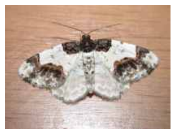
Scorched Carpet – Hythe – 27th/28th April

An unusual record of 3 Latticed Heaths at Hythe at light on the 24th/25th August presumably referred to migrants, as these were well away from the regular areas, and supposed migrants were noted elsewhere in Kent at the same time. The first Common Heaths were seen at Capel-le-Ferne on the 30th May, and a Willow Beauty at Hythe on the 24th/25th May was reasonably early date.