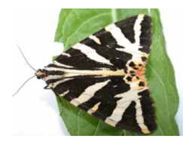
Jersey Tiger – Hythe – 10th/11th August

Highlight of the year was a superb Jersey Tiger caught at Hythe on the 10th/11th August (photo). There were only 3 Kent records prior to 2004 (however Dungeness recorded an incredible 6 between 8th and 15th August this year). There was an exceptional series of 7 Langmaid's Yellow Underwings in a 7 day period the first half of August – with 4 at Hythe and 3 at Folkestone between the 4th/5th and 10th/11th (photo). A Tree-lichen Beauty was trapped at Folkestone on the 3rd/4th August (photo) and the same site also hosted a Vestal on 10th/11th August, completing an amazing ten or so days.