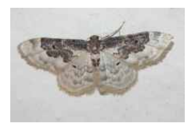
Least Carpet – Hythe – 16th/17th June