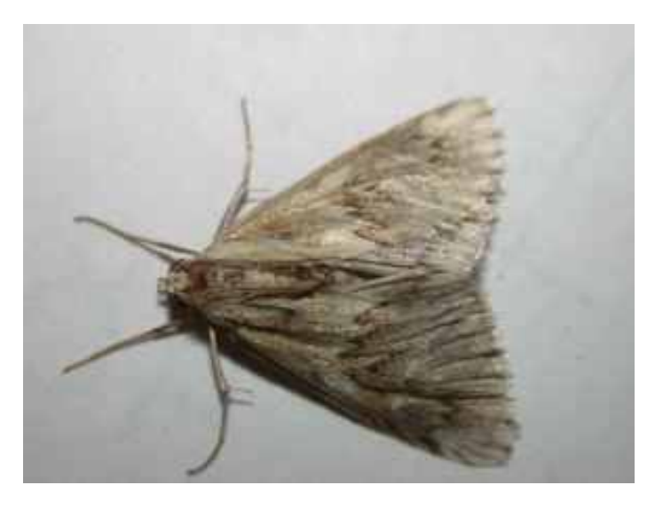
dentalis - Hythe - 14th/15th July (above & below)

The most notable sightings involved two Red Data Book species – dentalis – at Hythe on 14th/15th July (photo) and boisduvaliella – at Hythe on 29th/30th July (photo). Both are shingle-dwelling and might suggest the possibility of local populations on the nearby Hythe Ranges.