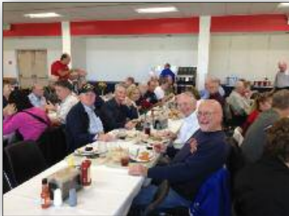
CGCVA gang having lunch with recruits at the Harbor View All-Hands Club.