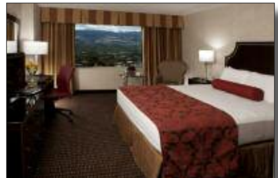
Silver Legacy Double Room on left; King Room on right.

Note: Upon arrival at the Silver Legacy, be sure to check the times of the events and tour as they are subject to change.