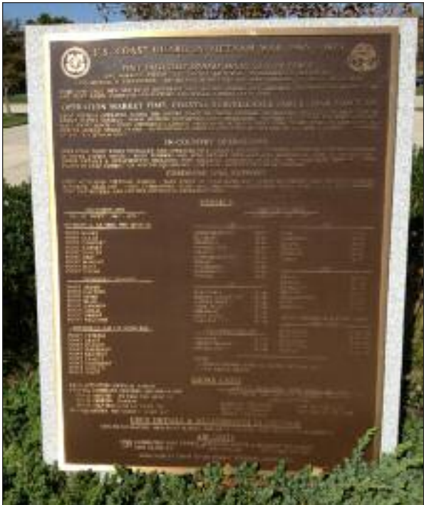
CGCVA's Vietnam Monument at USCG Training Center Cape May.