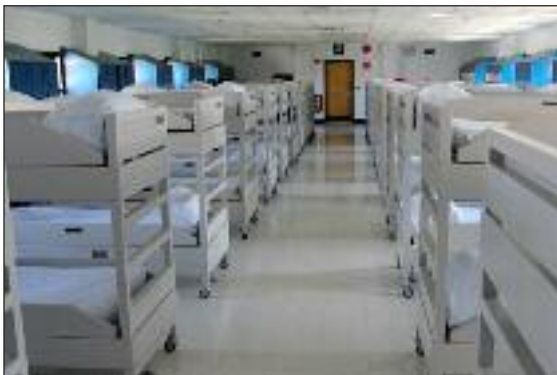
Today's modern recruit barracks at Training Center Cape May.