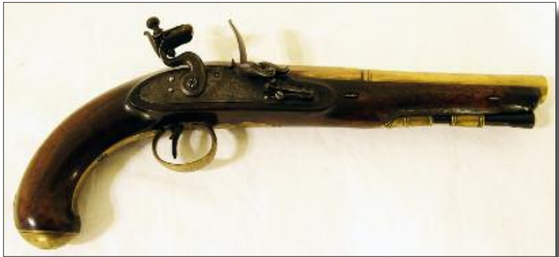
Customs flintlock pistol from 1810 similar to those used by cuttermen during the War of 1812 (Coast Guard Collection).