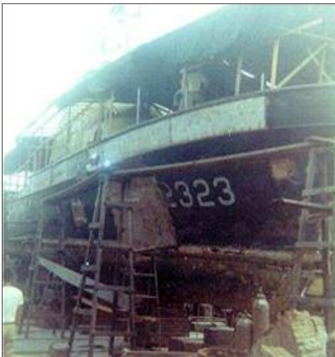
Point Grace undergoing repairs in Singapore.

On January 30, 1970 the Point Grace and Point Cypress , while participating in Sealord Op. 1193, entered the Rach Bang Gung, from the Ham Luong river, Kiem Hoa Province. We were conducting a maximum boarding and PSYOPS mission. There were 52 craft boarded and various materials (soap, candy, cigarettes, flyers,) distributed without incident. The Point Grace turned down the Rach Sau canal to exit to the Ham Luong river. I was set up on the roof with an M-60 machine gun. I reported to the CO that I could see a male running along the embankment and asked if I should "take him". The CO said no because he was in a return fire only zone. He disappeared. As the Point Grace was exiting the Rach Sau canal we were ambushed by an unknown force. We received heavy automatic fire from both banks and B-40