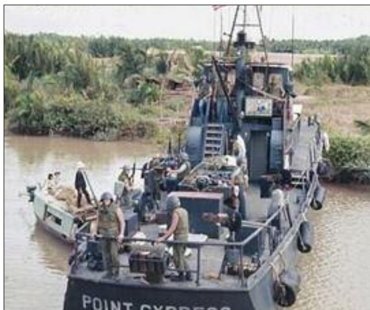
Point Cypress conducting boarding prior to ambush.

During the afternoon we observed several Viet Cong flags flying on the both banks. During the boarding operations several persons were detained without proper ID papers. Subsequently we stopped by an ARVN outpost to drop off the detainees and visited with the US Army advisors who told us there had been a lot of VC activity lately.