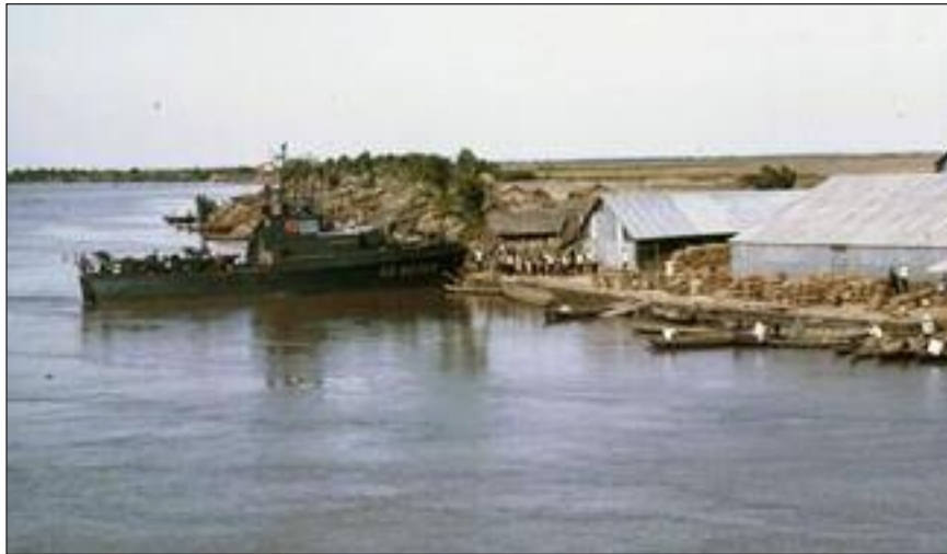
Point Cypress at village at mouth of My Than river.

We were all anxious to get out of the Ba Lai. The regular operating protocol was to have at least two boats together when operating in canals or rivers with a lot of VC activity. As the boat was exiting the Ba Lai we picked up activity ahead of us on our radar. As we approached the contacts the CO told us to be ready and turned on the spot light. There were two sampans full of VC crossing the river. We took them under fire with the forward .50 cal machine gun while the port and starboard guns fired at the both banks to cover us. One sampan was beached on the left bank and we received some small arms fire until our 50's opened up. The other sampan was caught mid stream and shot up killing one and wounding two other VC. The CO ordered myself and SN Kelly to take the Boston Whaler and search the shot up sampan. As we approached the sampan I noticed a hand hanging on the side. As I grabbed it the man climbed up my arm. I hit him with the .45 pistol I was holding and