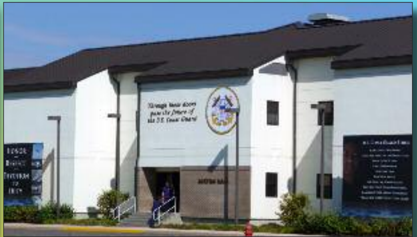
The Forming Company building circa 1966 (Top Left) was like a House of Horrors for many of us compared to the modern digs of Sexton Hall (Top Right).

How many remember scarfing down your food as quickly as you could at the old Mess Hall, circa 1966 (Below Left)?