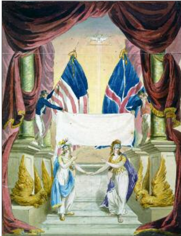
The illustration "The Peace" drawn after the conclusion of the war.