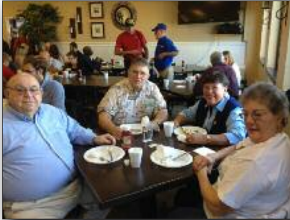
CGCVA members and wives enjoy breakfast at the training center's Harbor View All-Hands Club.