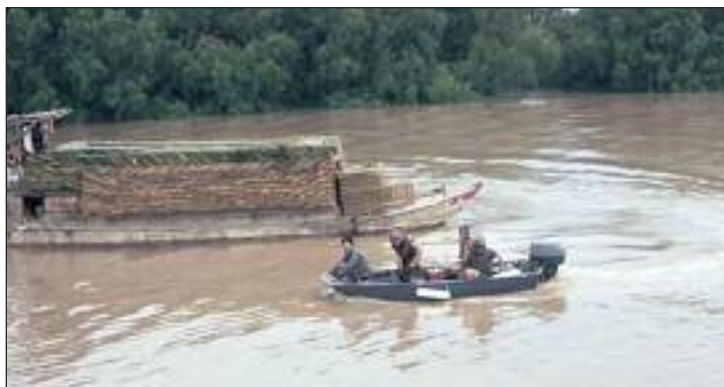
Small boat with detainee from boarding - Ba Lai river.

We departed the Ba Lai river to enter the Ham Luong river to patrol for the night. The Point Grace was traversing from the Ba Lai to the mouth of the Ham Luong when the commanding officer (Ebersol) received the transmission from the outpost that they were under attack by an unknown force of VC and were requesting assistance from any forces in the area. The CO responded and we turned the WPG around and headed back to the Ba Lai. As we approached the outpost we could see tracers flying both ways and hear the mortar and RPG explosions. We pulled the boat on the bank adjacent to the outpost and fired our