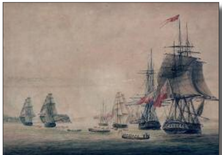
A War of 1812 illustration showing larger units of the Royal Navy supporting an attack against the U.S. mainland.