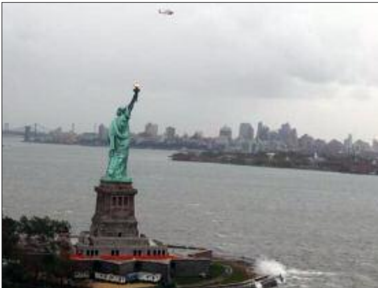
An MH-65T Dolphin helicopter aircrew from Coast Guard Air Station Atlantic City conducts an overflight assessment of New York boroughs impacted by Hurricane Sandy, Oct 30, 2012.

“The United States is a maritime nation and we rely heavily on the ports for commerce — 95 percent of our goods come to us by way of sea. Just about everything you purchase on an average trip to store, from yesterday’s Halloween candy to the shirt on your back,