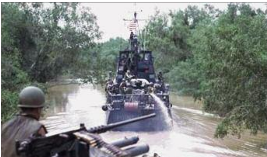
Point Cypress in Dung Island canal to extract SEAL Team.

Just as the voices quit a sampan came out of the canal on a collision course with us. We slipped the anchor, fired a pop flare to illuminate it, and I gave it a burst across it's bow. It contained a load of rice and two elderly individuals. They were very upset with us. We delivered them to the Point Grace , learning later they were VC. We then returned to the surveillance post. Bad idea. We were welcomed back with heavy automatic weapons fire. The skimmer headed further up