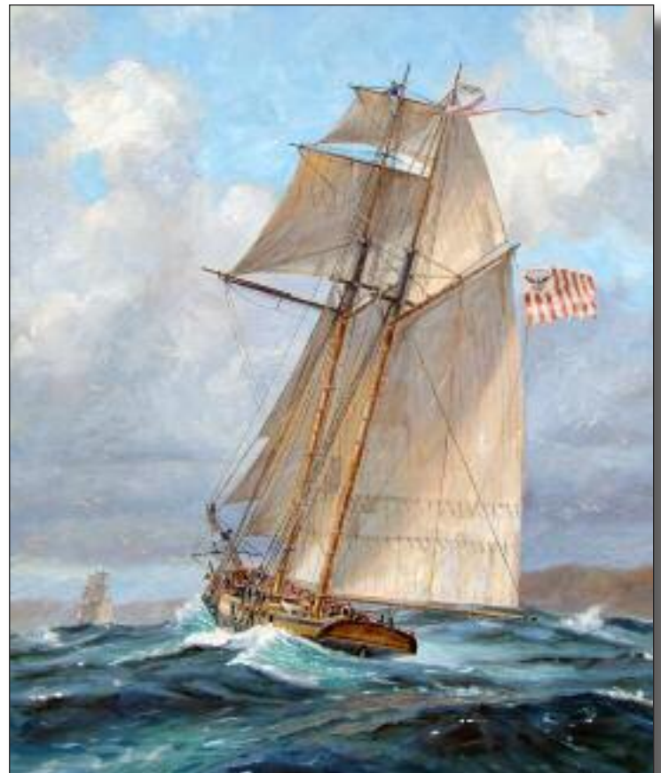
A painting by Patrick O'Brien illustrating the War of 1812 Cutter Eagle on patrol in Long Island Sound (Coast Guard Collection).

Before the war, the revenue cutter fleet served primarily as a maritime police force, enforcing U.S. trade laws and tariffs, and interdicting maritime smuggling. However, the War of 1812 solidified the cutters' naval role and new wartime missions, including high seas combat, port and coastal security, reconnaissance, commerce protection and shallow-water combat operations.