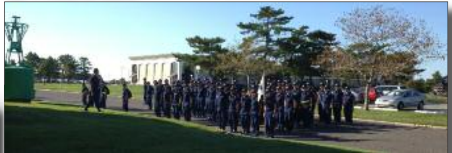
Recruit Company preparing for drill.