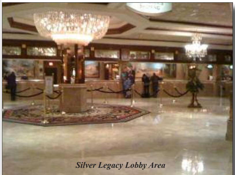
Silver Legacy Lobby Area