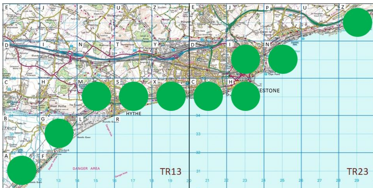
Figure 3: Distribution of all Yellow-legged Gull records at Folkestone and Hythe by tetrad

Figure 3 shows the distribution of records by tetrad. Most of the records have been coastal, with 15 between Copt Point and Mill Point, six at Samphire Hoe, four at Battery Point/Sandgate, and two at Hythe and the Willop Basin, but there have also been six at Nickolls Quarry and one at Saltwood.