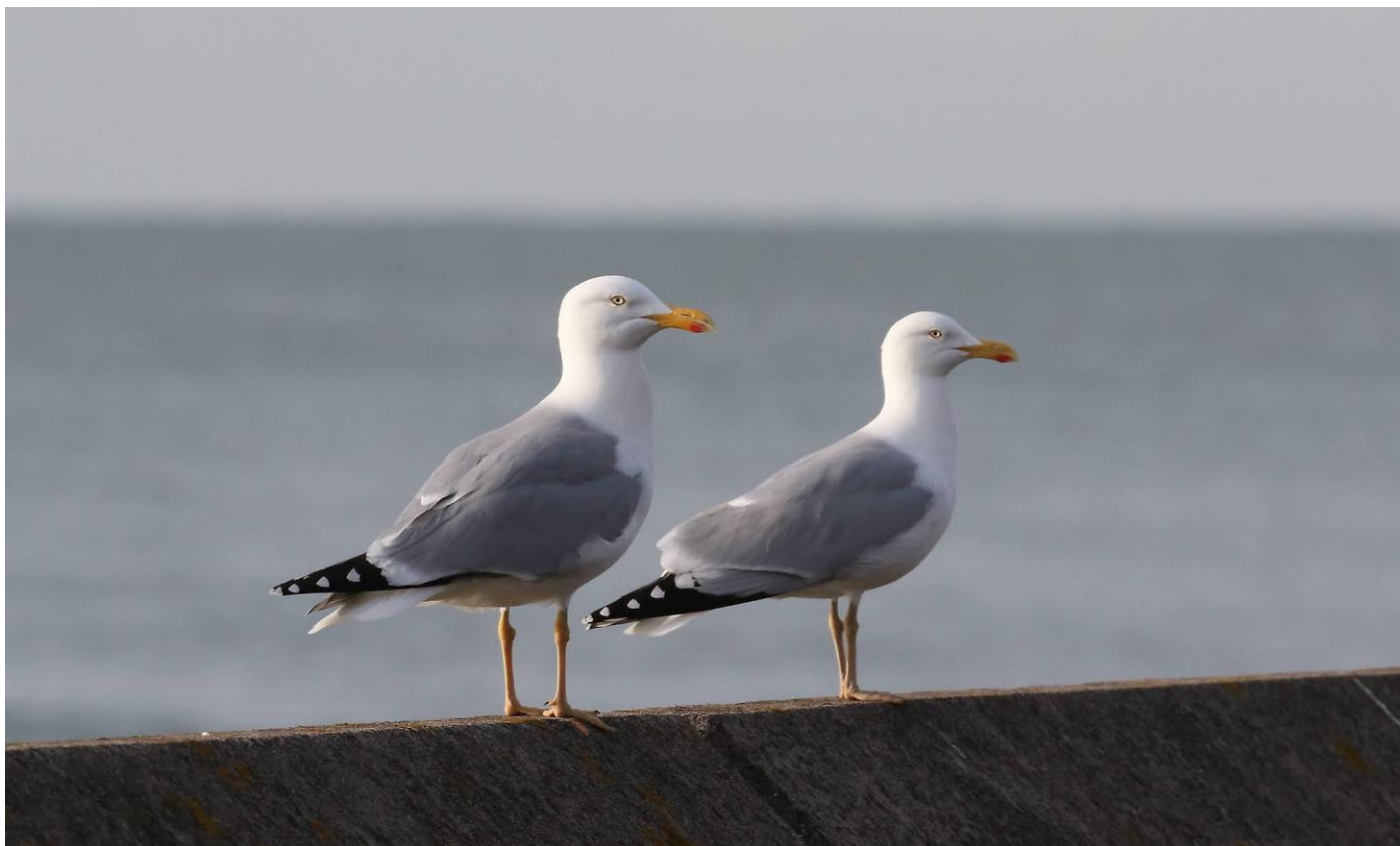
Adult Yellow-legged Gulls at Samphire Hoe (Phil Smith)