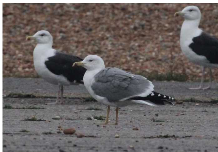
Adult Yellow-legged Gull at Mill Point (Ian Roberts)