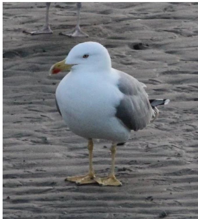
Adult Yellow-legged Gull at Folkestone Harbour

It is a regular passage migrant in Kent, particularly to the inner Thames in autumn.