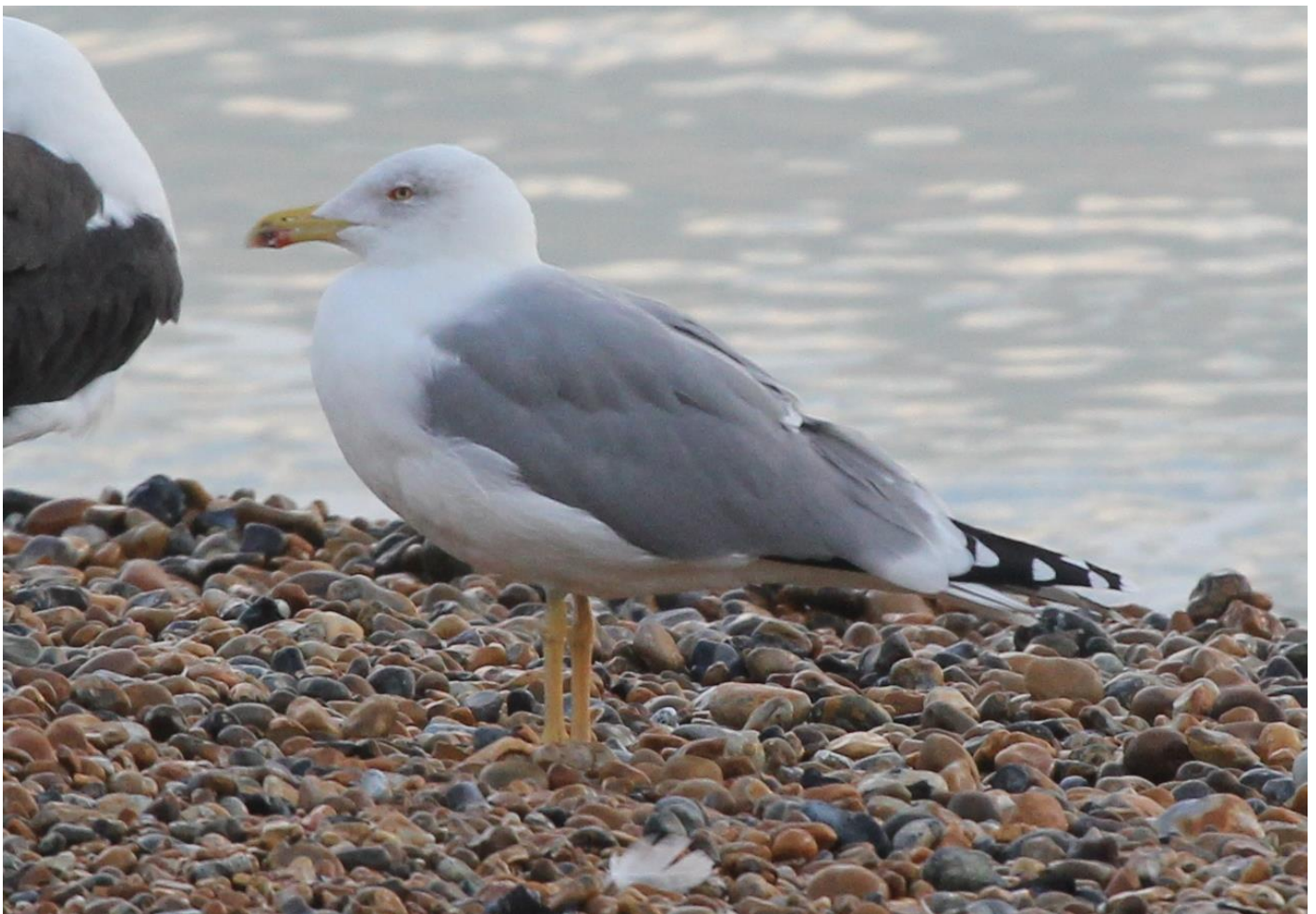
Adult Yellow-legged Gull at Sandgate (Ian Roberts)

Click here to watch a local short video recording of an adult at Folkestone Harbour in December 2016 (Ian Roberts).