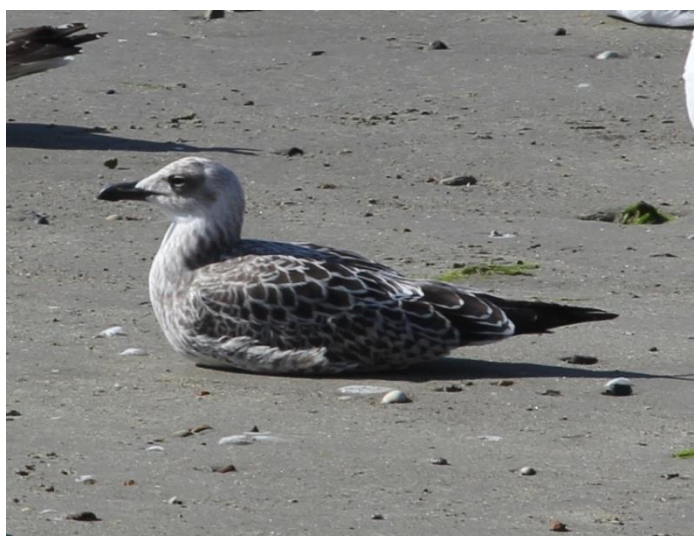
1CY Yellow-legged Gull at Folkestone Harbour

It has been recorded with some regularity locally since 1992, with 33 records in 30 years, as demonstrated by figure 1. The best year to date was 2021, with six records.