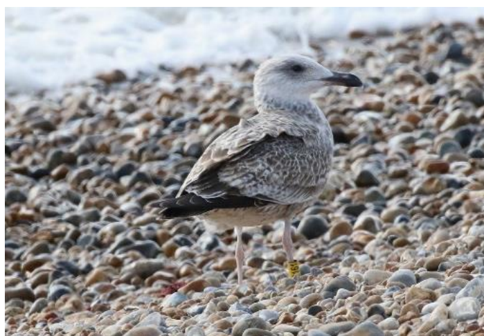
1CY Yellow-legged Gull at Sandgate (Chris Powell)