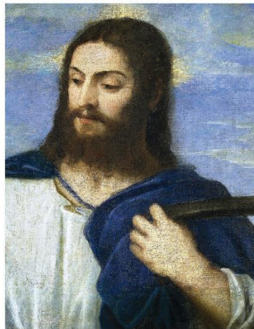
CHRIST AS THE GARDENER (DETAIL), TITIAN

Jesus uses the title to stress his true humanity and identify with us. Jesus as Son of Man must suffer and die. Every time Jesus prophesies about his death, it is as the Son of Man. Jesus connects the title with his passion and death, linking it to Isaiah 53, the great Song of the Suffering Servant. Also, in using that title Jesus is explicitly saying that he is the one fulfilling those prophecies of Isaiah and Daniel, as when he said in the synagogue, "Today this scripture passage is fulfilled in your hearing" (Luke 4:21).