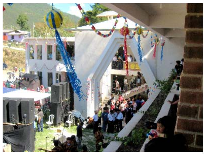
The shape of the entrance opening into a spacious patio has significance in the Mayan culture where the community gathered for ceremonies and events. Here we see its beauty from different angles and the well finished spacious upper and lower corridors that awed even the little children being protected from falling below by an elder.