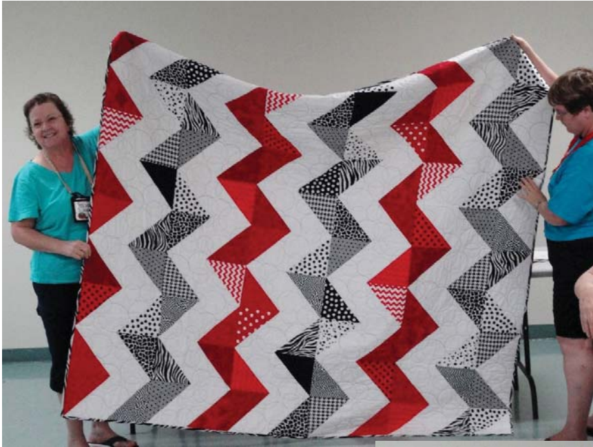
Shannon's red, white and black zig zag quilt