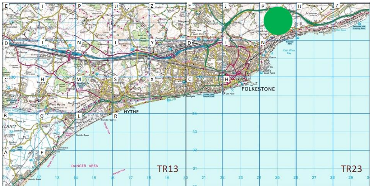
Figure 3: Distribution of all Booted Warbler records at Folkestone and Hythe by tetrad

Confirmation of the only area record is as follows: