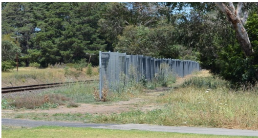
Mornington-Tyabb to Craig Avenue

We asked the Council to write to Metro Trains to get them to clean up the weeds and long grass and generally improve these unkempt, but well used local walkways.