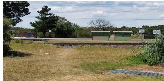
Kathleen Crescent to Frankston-Flinders Rd

We were Gobsmacked by the response from Metro Trains. They have advised that they will clean up the weeds and blackberries, but that both locations are illegal to walk along or cross and anyone observed walking here will be issued with an infringement for trespassing on railway land.