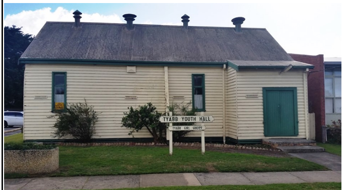
Tyabb Youth Hall on The Crescent

The building itself is heritage listed as it was the first community hall in the town. It was moved to its present situation early in the 20 th Century by various local families who donated the land and physically moved the building and gifted the building to the youth of the town. Because of its heritage listing the full maintenance program will take longer than usual, but rehabilitation works to bring it back to a habitable state will be undertaken as soon as possible.