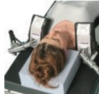
BD-SS Shoulder Braces Adjustable on Linear Plane Integral Clamps