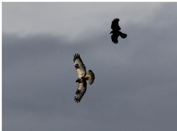
Rough-legged Buzzard at Nickolls Quarry (Ian Roberts)

Breeds in high latitudes in subarctic and arctic Fennoscandia and Russia, largely in low-lying, treeless, tundra areas. In years favourable for prey, spills over into wooded tundra and even taiga, but, in contrast to Common Buzzard, at all seasons strongly prefers open terrain with good distant visibility and rough low-growing vegetation favourable to prey species. Winters from the Baltic southwards to the Alps, Carpathians, northern Black Sea, and north Caucasus. A few cross the north sea to eastern Britain (Snow & Perrins, 1998).