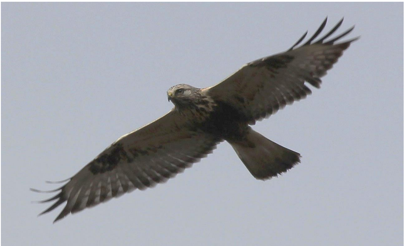
Rough-legged Buzzard at Nickolls Quarry