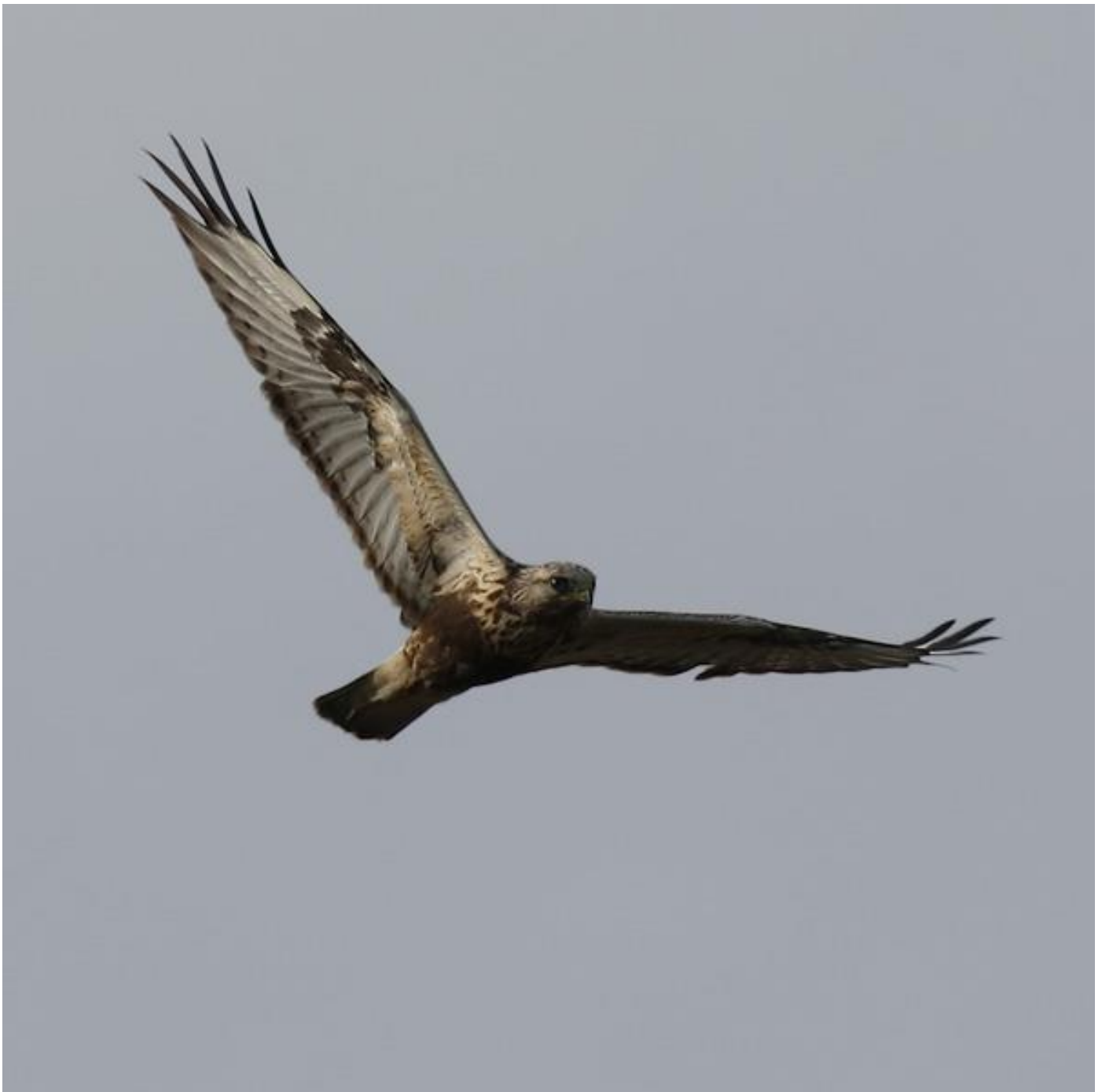
Rough-legged Buzzard at Nickolls Quarry

The tetrad map images were produced from the Ordnance Survey Get-a-map service and are reproduced with kind permission of Ordnance Survey .