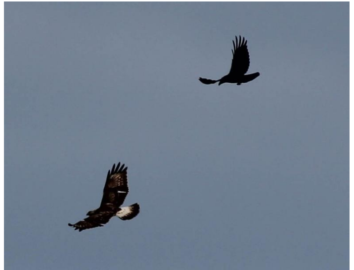
Rough-legged Buzzard at Nickolls Quarry