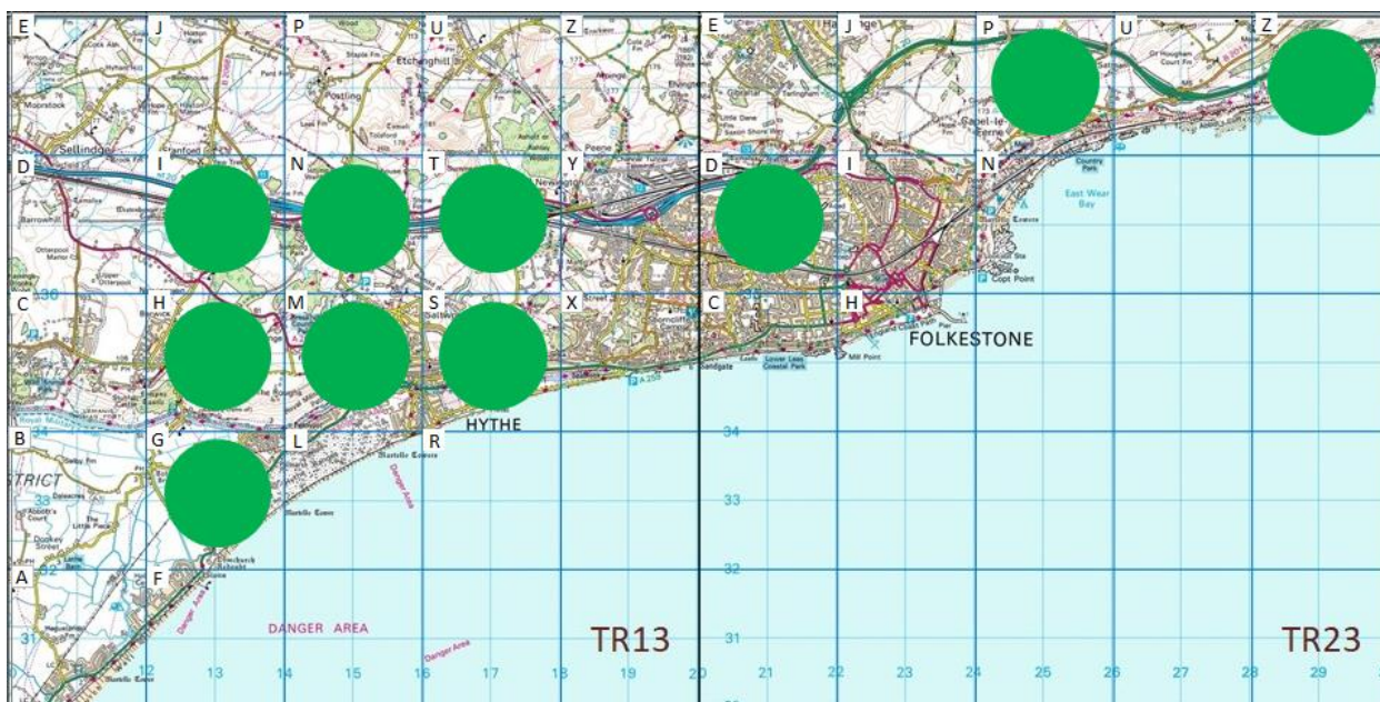
Figure 3: Distribution of all Rough-legged Buzzard records at Folkestone and Hythe by tetrad

Figure 3 shows the distribution of records by tetrad