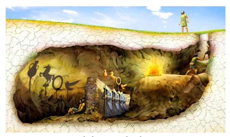
People leaving Plato's Cave

The Bible sees a similar problem of slavery. Those under this slavery also lack knowledge, but not knowledge of the problem—as in The Cave or The Matrix. No, people know that perfectly well. They just choose to suppress this truth (Rom 1). Rather, they lack the knowledge of the solution to the problem. They need to be told this solution, and through it, God sets people, who in many ways didn't even know they were slaves, free.