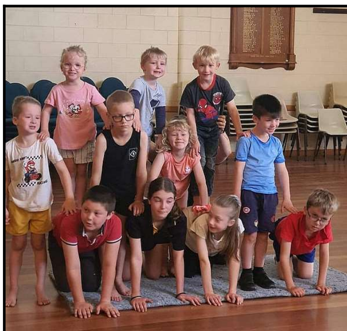
Above: these children had fun at Clown School on December 15 at the Memorial Hall.