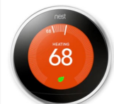
Google® Nest Learning Thermostat - Stainless Steel MSRP: $249.00 $149.00