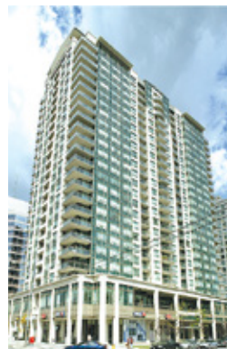
MAJESTIC 2 NORTH YORK

Building with five decades of excellence, The Conservatory Group is proud to be at the forefront of the industry, shaping new home communities across the Greater Toronto Area.