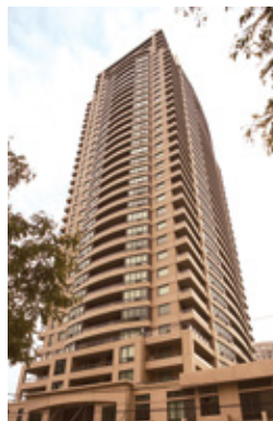
PLATINUM NORTH YORK