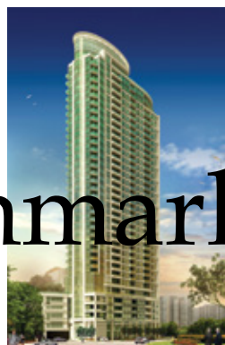
WIDE SUITES MISSISSAUGA