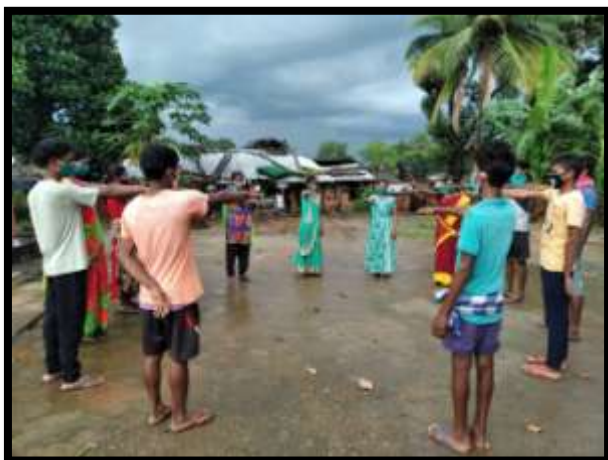
Oath taking by the villagers to end child marriage in their area