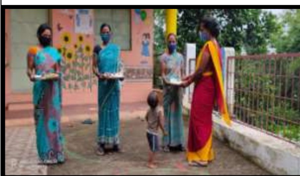
Supply of food items by the AWW during COVID 19 lockdown period to the villagers of Gudandgorjan model village.