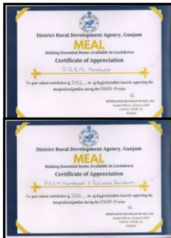
Certificates of appreciation from district administration for supporting the marginalised families during COVID 19

PREM in collaboration with Reliance Foundation, Mission Anna Seva, Mumbai worked persistently in response to COVID-19 pandemic to be at the service to the people has been distributed dry ration kits to 1500 vulnerable and needy beneficiaries in 4 blocks—Dharakote, Chikiti, Patrapur, Kukudakhandi and Hinjili Block—of Ganjam District in the month of August 2020. The District Administration has been proposed the identified target groups for distribution of the kits in Ganjam District. The distribution were done through a convenient mobile based App called Jotform which help in data collection and reporting on a real time basis. The District administration, Ganjam appreciated the work of PREM and Reliance Foundation and felicitated with certificates for supporting the vulnerable families during COVID 19 pandemic.