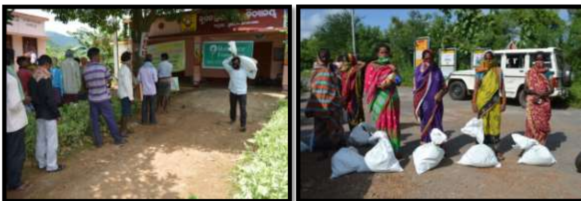
Beneficiaries received ration kits at 4 block of Ganjam District