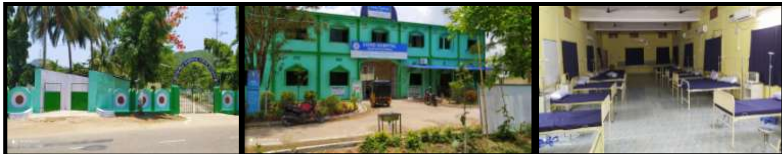
COVID hospital established at "Bharatmata Training and Resource Centre" of PREM at R. Sitapur, Parlakhemundi of Gajapati district

The District administration, Gajapati has established a COVID hospital in PREM's existing training and resource centre at R. Sitapur at Parlakhemundi, Gajapati district which is having an accommodation for 400 people is known as "Bharatmata Training and Resource Centre". In the month of April 2020 the district administration requested PREM to use the building as COVID hospital for Gajapati district and PREM has given the building for establishing the hospital. At present it can accommodate 200 patients with all facilities.