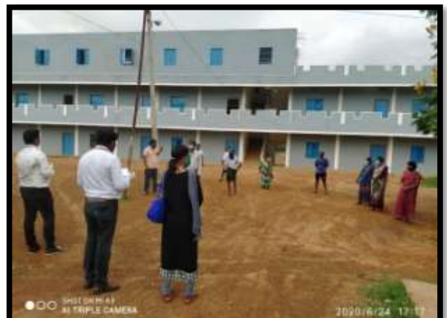
Visit to Temporary Medical Centres of Gajapati district and interaction with the returnees by following the key COVID appropriate behaviours.

During COVID 19 lockdown period PREM-UNFPA District Consultant along with officials from District administration, Gajapati district visited different Temporary Medical Centers(TMC) of Gumma and Nuagada blocks of Gajapati district and they met with the people who were staying for 14 days as quarantine at the centres after returning from the other states. As it was quite natural that the returnees were going through emotional and mental strain. The team visited regularly to the centres to meet these people, to give them moral support and also to address their issues. This initiative gave life