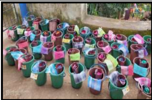
Sanitary kits supplied to the 9532 households of 231 PVTG villages of 21 Gram Panchayats of Gajapati and Rayagada Districts of Odisha