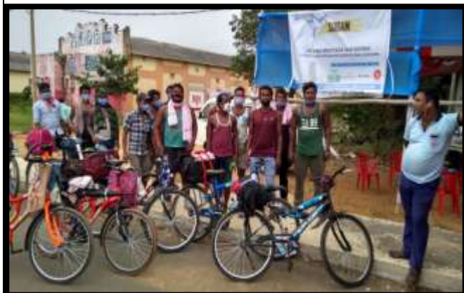
Migrants going by bi-cycles in the highway to their native states