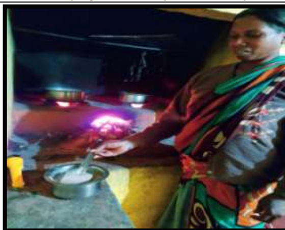
Hygiene kitchen at model village of PREM