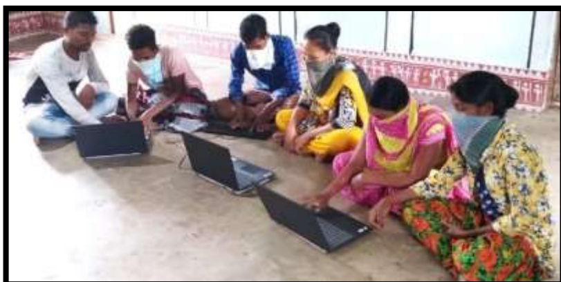
Basic Computer training provided under Bridge IT program

Under the Bridge IT program of PREM, the Odisha Module continued their basic Computer training in both Rayagada and Gajapati districts. Due to Lockdown the training programs were conducted regularly virtually via Zoom App. Also through online session regular classes continued from morning