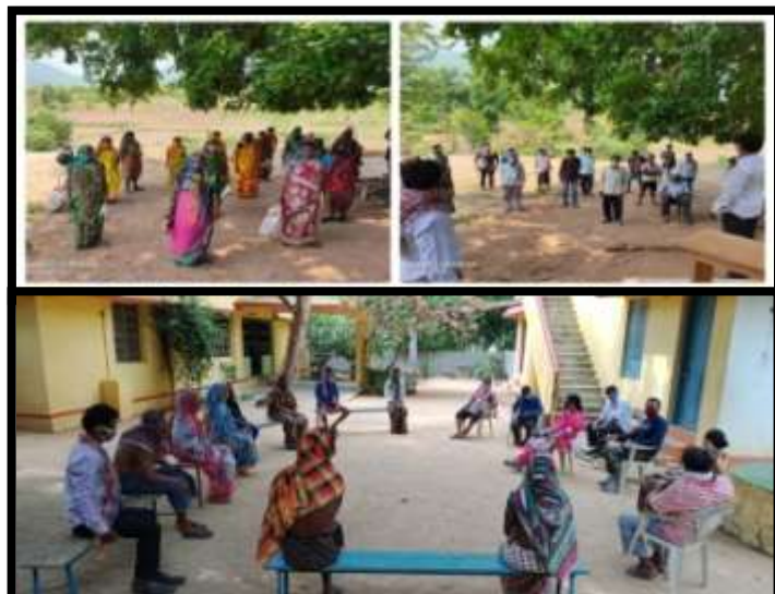
Awareness meeting on Covid-19 in operational areas of PREM

(5000 families) in its operational area— Ganjam, Gajapati, Kandhamal, Rayagada, Puri during this pandemic period. The field staff of PREM and volunteers organized these meeting at different villages of the