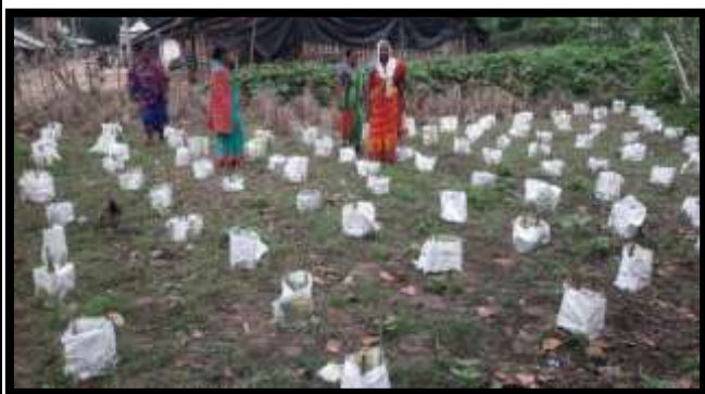
Vegetable cultivation by SHG members by adopting new techniques to protect seedlings from birds and animals.