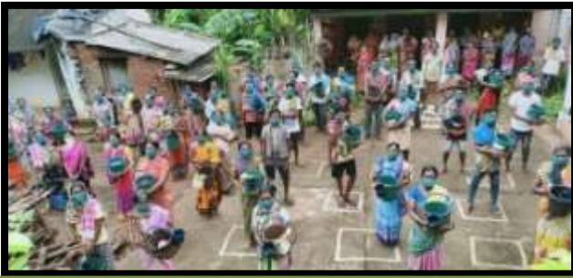
Distribution of hygiene kits to 9532 households of 21 panchayats of Gajapati and Rayagada districts

Gajapati and Rayagada Districts of Odisha. Simultaneously creating awareness on using mask, regular hand washing practice, personal hygiene and maintaining of social distancing. The awareness on the above topics was very informative for the villagers and they expressed their gratefulness to PREM for providing the hygiene kits which will be very useful for them.