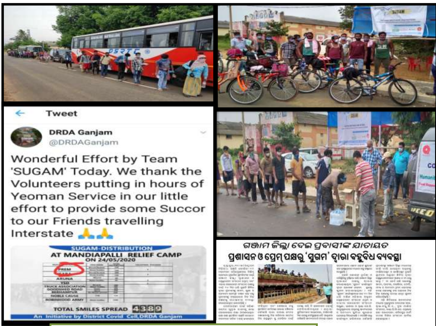
Distribution of dry food packets to the migrants under SUGAM program

PREM along with other NGO networks of Ganjam district extended its collaboration with the SUGAM program —An initiative taken up by DRDA, Ganjam District—to ensure no migrant worker to walk in Odisha. In this initiative it started a mission of distributing the dry food and water bottles to 3000 migrant people who were returning back to their native places but due to lockdown situation there was no means of transportation and availability of food. Similarly district administration arranged transportation facilities for them to cross the district from 19th May 2020 at Mandiapalli Junction, NH 16. PREM also mobilized some charitable institutions to support in this mission and some of such institution came forward to support cooked food, dry food, water, masks, towels, caps etc.