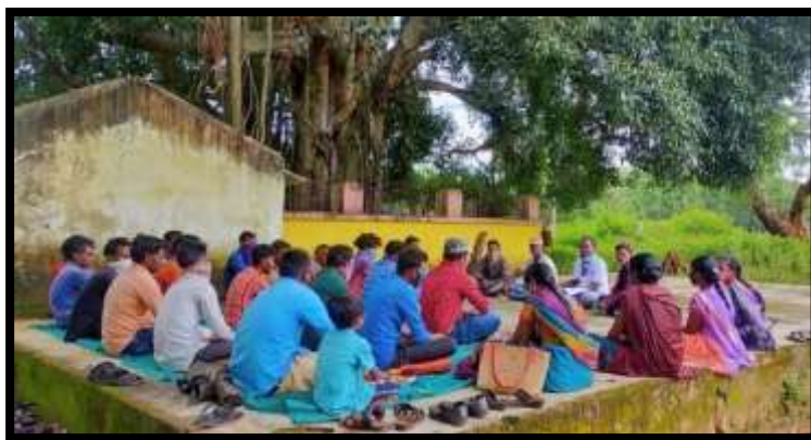
Orientation meeting to the migrant labourers at Daringbadi block

In the month of August, PREM organized Gram Panchayat wise meetings of the migrant labourers who had returned home from different cities of India. Not only the migrants of the program communities were primarily the participants of the meetings but also other family members and other community members also participated in the meetings. The main themes of discussion were the government provisions for the migrant labourers and advocacy to realize the same. The meetings thrashed the issues, the provisions and the format of application. The migrants along with the community members submitted memorandums to the respective Panchayat presidents(Sarapanches) and to the Block development Officer (BDO) for getting some work opportunities in their respective localities. There is hope that the migrant laboureres will avail themselves of the provisions made for them by the government of India and the State Government.