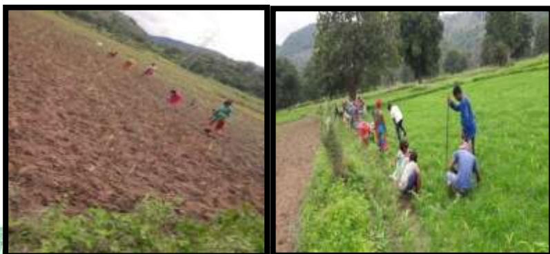
Lemon grass plantation in Mohana block of Gajapati district in the respective lands of the beneficiaries

members are strengthened and oriented regularly by the project team to explore more livelihood opportunities and to leverage the Govt. schemes and provisions. After liasioning and converging with