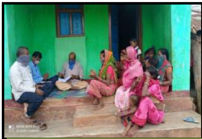
Baseline survey at Mohana block of Gajapati district

PREM in collaboration with Give India Foundation (GIF) has initiated a women empowerment program in 50 tribal communities of 15 nos of Gram Panchayats of Mohana Block, Gajapati District.