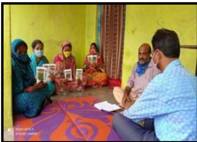
vegetable seeds distribution to the beneficiaries by OPELIP (Odisha Primitive Empowerment Livelihood Improvement Project), at Mohana block, Gajapati district