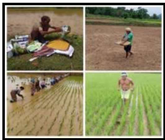
Hybrid and scented paddy(Ankur) cultivation under FADP project Gunupur

Following are the key activities conducted in this period: