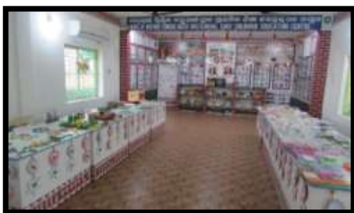
National Resource and Training Center (NRTC) of PREM at Mandiapalli

PREM has established a National Resource and Training Center(NRTC) at Mandiapalli, head office since 2015. The main motto of establishing the National Resource and Training Center (NRTC) was to bring more understanding among the different stakeholders on MT ML ECE and to enhance the skill and knowledge of existing ICDS workers in tribal areas of Odisha and India on the transaction of MT ML ECE. The