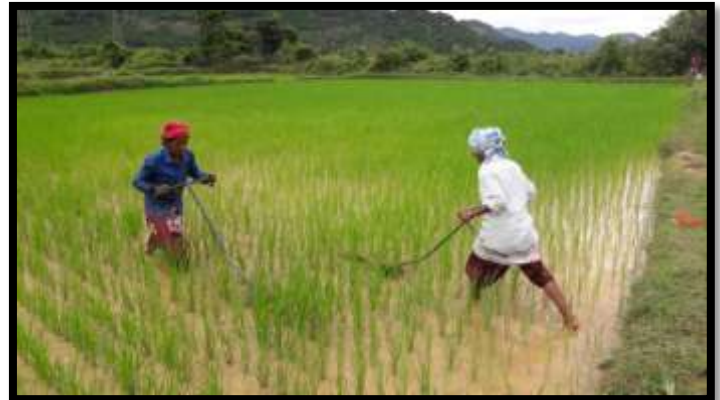
SRI cultivation Mohana block of Gajapati district 1500 acres of land was done in Mohana block.

horticulture officials now different horticultural activities are going on very nicely in different villages. such as plantation of cashew, mango, drum stick and papaya and the group members are getting a regular income out of it. Some of the farmers also received the lemon grass seedlings from horticulture department. The lemon grass has been planted in 150 acres of land in Gubriguda village, Kerakhala village, Kristopur village of Mohana block of Gajapati district. Similarly SRI cultivation has been done in 1500 acres of land was done in Mohana block.