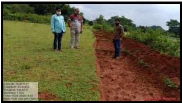
Visit of line department officials to the Wadi plantation area under MGNREGA program of ITDA, Gunupur