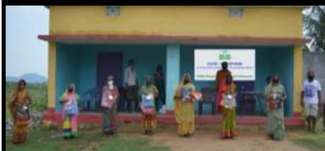
distributed clothes which includes (1 Saree, 1 Towel, 1 Lungi & 1 Dhoti) and Seed packets at Dantaling village of Asurbandh Gram Panchayat of Sorada of Ganjam District

PREM has distributed clothes which includes (1 Saree, 1 Towel, 1 Lungi & 1 Dhoti) and Seed packets to the 386 migrant and vulnerable families of Dantaling village of Asurbandh Gram Panchayat of Sorada of Ganjam District, Odisha. There were 44 widows and 12 widowers in these 386 families. We have separate cloth packets for these vulnerable families. The whole community was so happy after receiving clothes and seed packets from PREM during COVID-19 Pandemic lock down. Indeed it was a great support for the vulnerable families during this COVID-19 Pandemic Lock down.