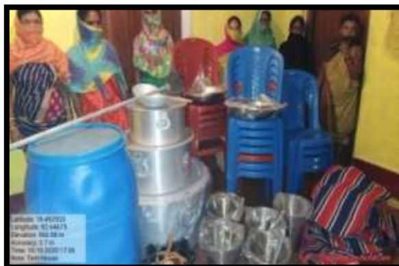
Distribution of tent house materials to the SHGs under OTELP Plus program at Nandapur block, Koraput