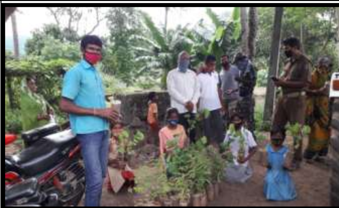
Wild plant saplings received from the Forest department of Mohana block of Gajapati district