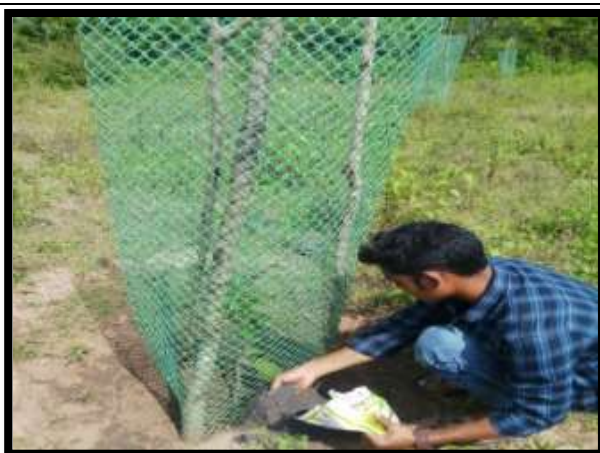
Application of bio fertilizer to the plants under the wadi plantation program