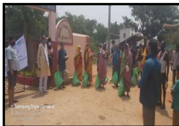
Ration kit distribution at Gopalpur Sasana GP of Sorada block of Ganjam District