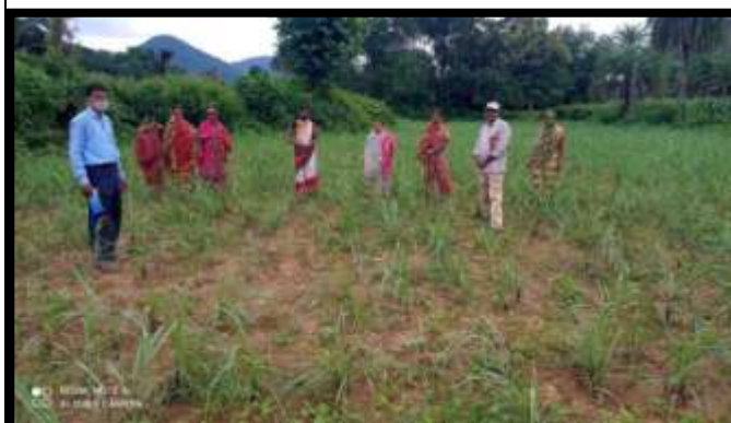
Lemon grass plantation at Mohana block of Gajapati district