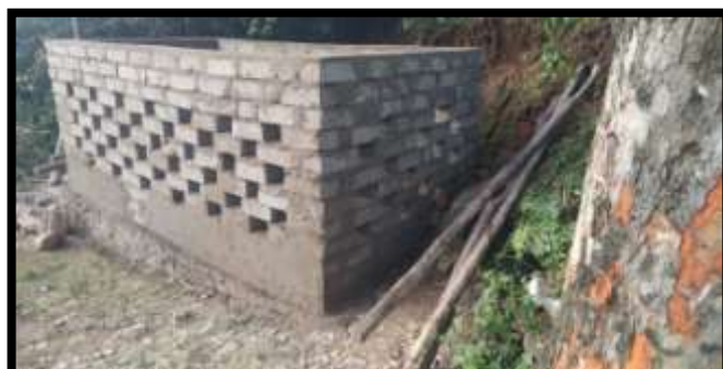
NADEP model compost tank at Dimbiripankal model village respective backyards

In two model villages—Gudanggorjang and Dimbiripankal—of Gajapati district NADEP system of composting is introduced by PREM. Gudanggorjang has filled one of the compost pits with compostable dry and green leaves, fertile soil mixed with fresh cow dung slurry.