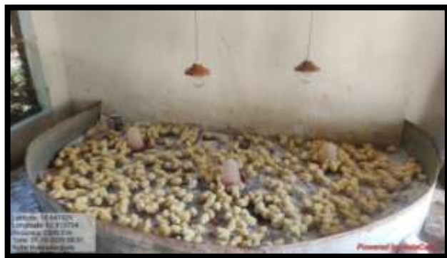
Mother chicks units established in four SHGs in three VDCs of Nandapur blocks