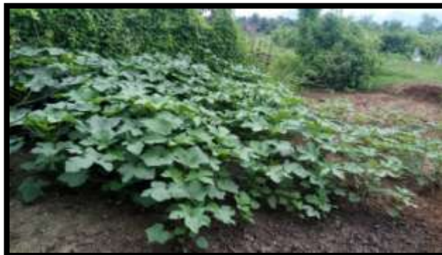
Kitchen garden developed by the beneficiaries in their respective backyards

beneficiaries have developed kitchen gardens in their respective backyards. As a result the families are getting nutritious food with greens vegetables from the kitchen gardens and after consuming they are also selling the vegetables in their local market and getting a small amount of income in the pandemic situation. This initiative generated interest among the villagers for who are motivated to initiate kitchen garden backyard cultivation in their homes.