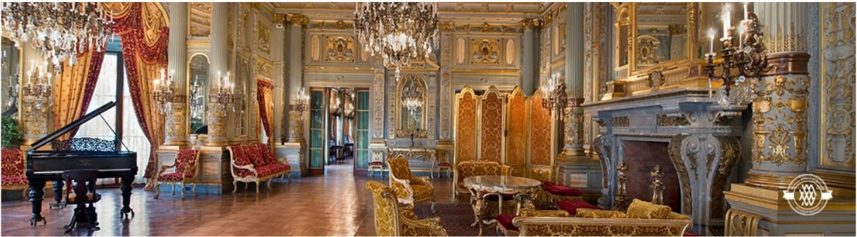
The Breakers, overhead top left, and interior, above, the summer home of shipping magnate Cornelius Vanderbilt. The 70-room mansion covers more than an acre with 62,000 square feet of living space in 5 floors.

SEAPORT, a living history museum showcasing the many activities that might have occurred in a New England coastal village in the 1800s. On to Rhode Island, the “Ocean State.” (B)