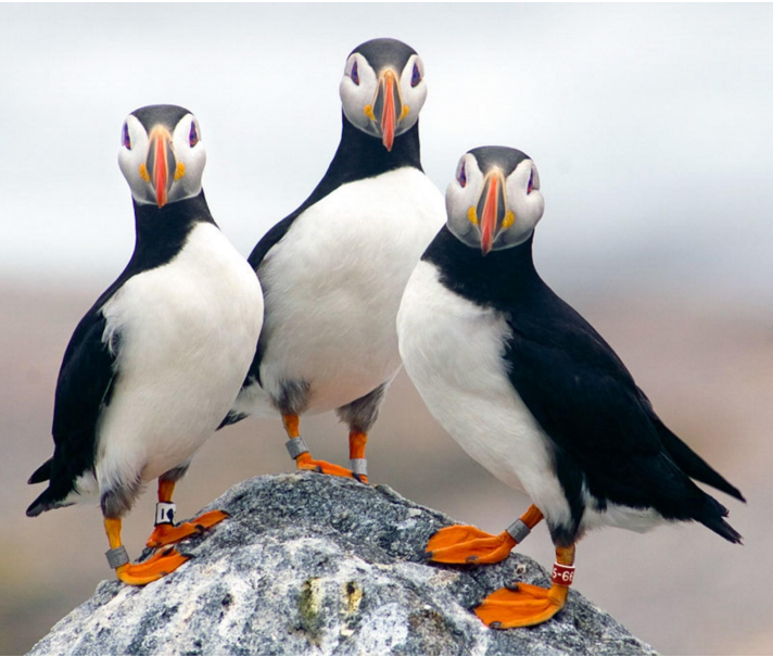
Puffins, at right, are the arctic equivalent of the Antarctic penguins. The Acadia National Park in Maine is the southernmost tip of the Puffin’s range. The cute birds with the colorful beak are so popular that the Park Service lists “where can I see Puffins?” as its most frequently asked question, and the answer is, you can’t. The birds’ rookeries are normally located pretty far from shore and the tourist areas.