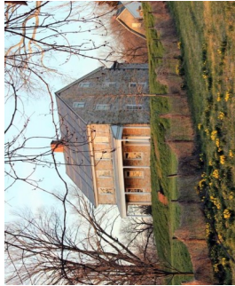
HALDEMAN MANSION PRESERVATION SOCIETY