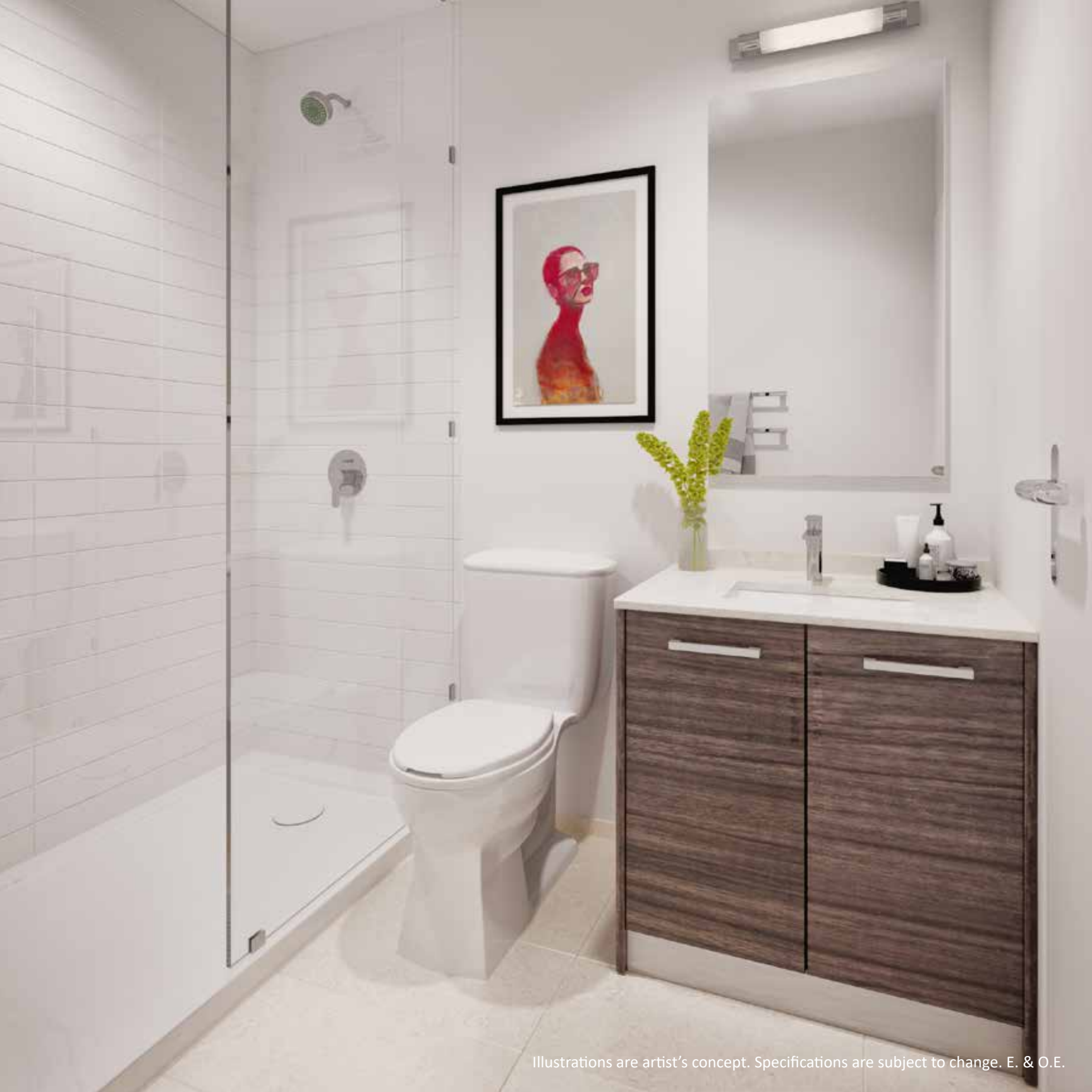
Illustrations are artist’s concept. Specifications are subject to change. E. & O.E.

From Vendor’s standard samples All specifications and materials are subject to change without notice. E. & O. E.