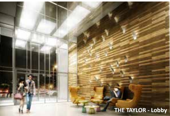
THE TAYLOR - Lobby