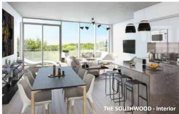
THE SOUTHWOOD - Interior