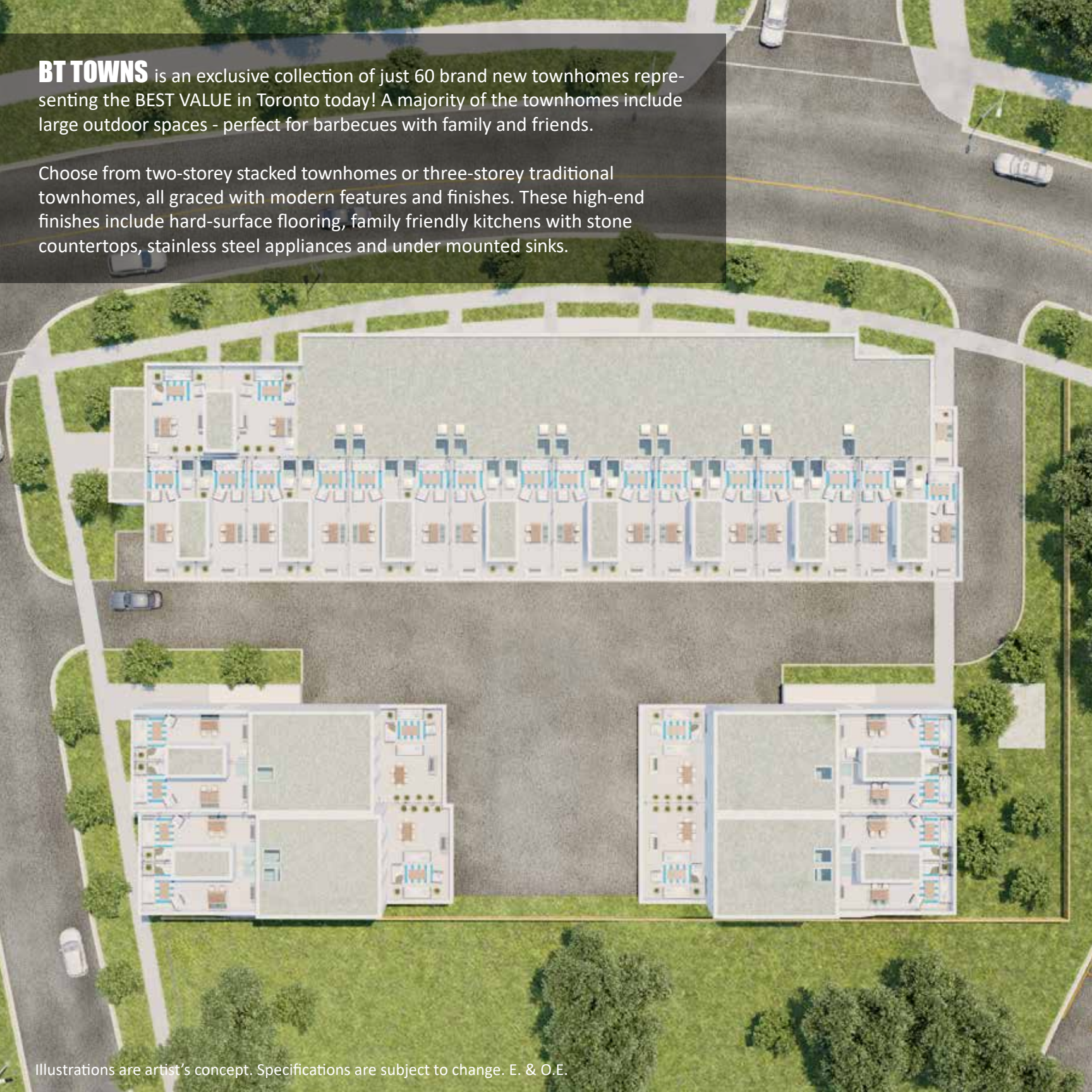
Illustrations are artist's concept. Specifications are subject to change. E. & O.E.

Choose from two-storey stacked townhomes or three-storey traditional townhomes, all graced with modern features and finishes. These high-end finishes include hard-surface flooring, family friendly kitchens with stone countertops, stainless steel appliances and under mounted sinks.