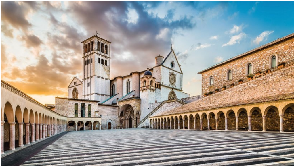
St. Francis' Basilica at Assisi

religious order devoted to the ideals of humility, forgiveness, simplicity, and love for all God's creatures.