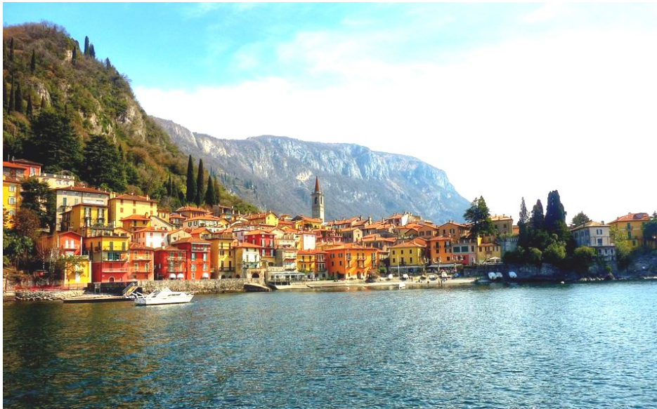
Bellagio at Lake Como