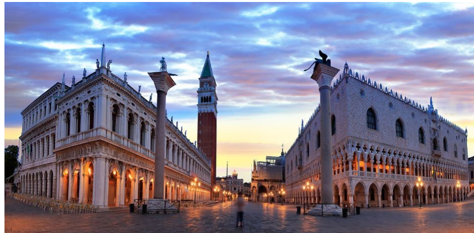
Doge's Palace on St. Mark's Square in Venice.