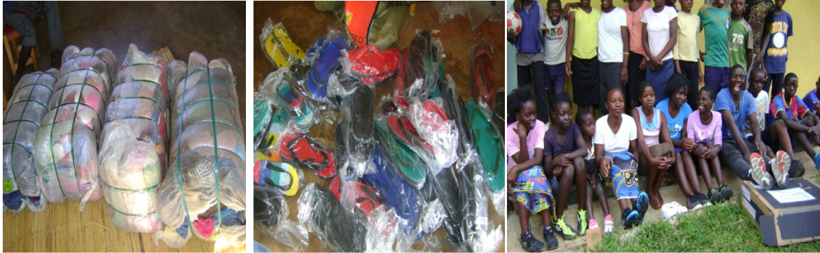
Clothes, Flip-flops & shoes for children

Every year children are outfit into new clothes. The care givers help the young children in buying clothes while the older children are given an opportunity to buy partly some of their choice clothes. Shoes are usually bought by the visiting volunteers from either St. Georges, Rome, Italy or College Dülèman, Geneva, Switzerland.