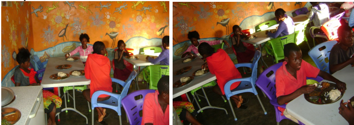
Nshima with Chicken and Vegetables

SOCH has maintained feeding orphans with a very well balanced diet. Children are growing healthy. One of the children's favorite meal is Nshima with Chicken shown bellow.