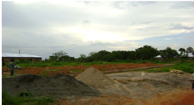
Guest house Construction