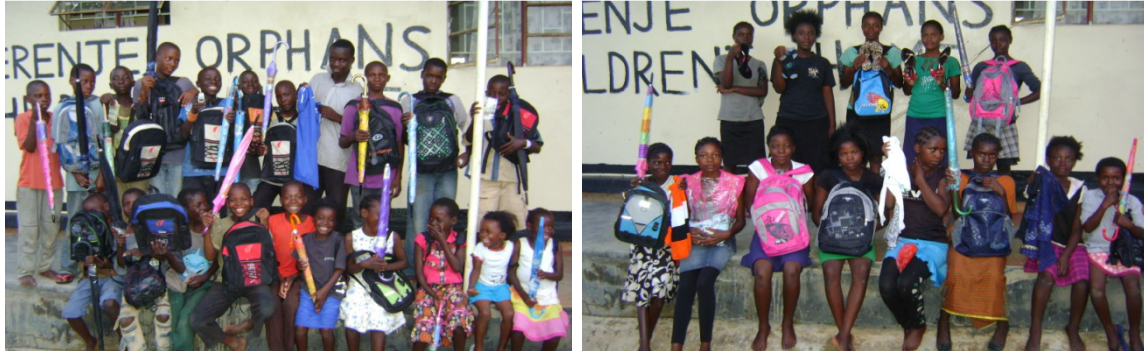
What can children do with pocket money has encouraged SOCH

Children have personal interests and they need to make their own decision at some point in time. SOCH entrusts children to decide wisely on the use of resources such as money and materials. When SOCH children were given pocket money, Children had bought different things. Others bought school bags and umbrellas to use in current rainy season while others bought bags, sweets and African cakes (fitumbuwa) which they miss in life because they do not have money.