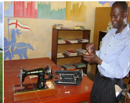
Clean environment and machine repairing