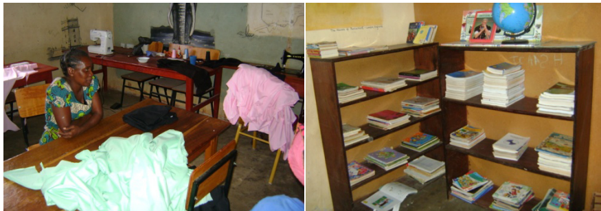
Uniforms sewn by trained care giver & books in Library

All orphans accepted into the orphanage must go to school. This is the priority at the orphanage and so children's uniforms are made by the care takers in addition to what are bought. There is also a library where children do study every day. All orphans are provided for fees, uniforms, books and for boarding schools goes transports and all requirements are given.