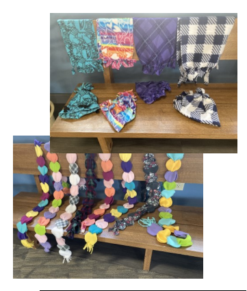
Hats and scarves

Thanks to all who gave their time and talents in keeping the spirit of the Morning of Service going in these difficult times. Special thanks to the team leaders for both onsite and offsite projects. We hope that the 2022 Morning of Service event can go on with a full slate of offsite and onsite activities.