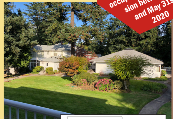
View from unit's balcony.

WINTER SPECIAL! First month's rent FREE to a permanent occupant taking possession between now and May 31st, 2020