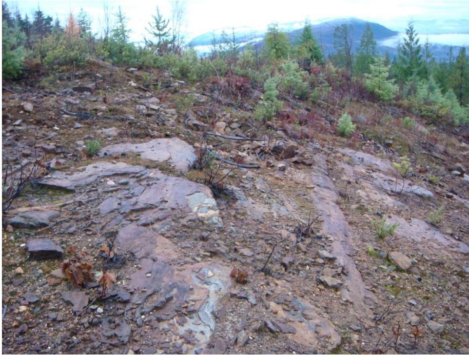
FLAKE GRAPHITE bearing outcrops - rusty graphitic biotite-quartz-feldspar gneiss;