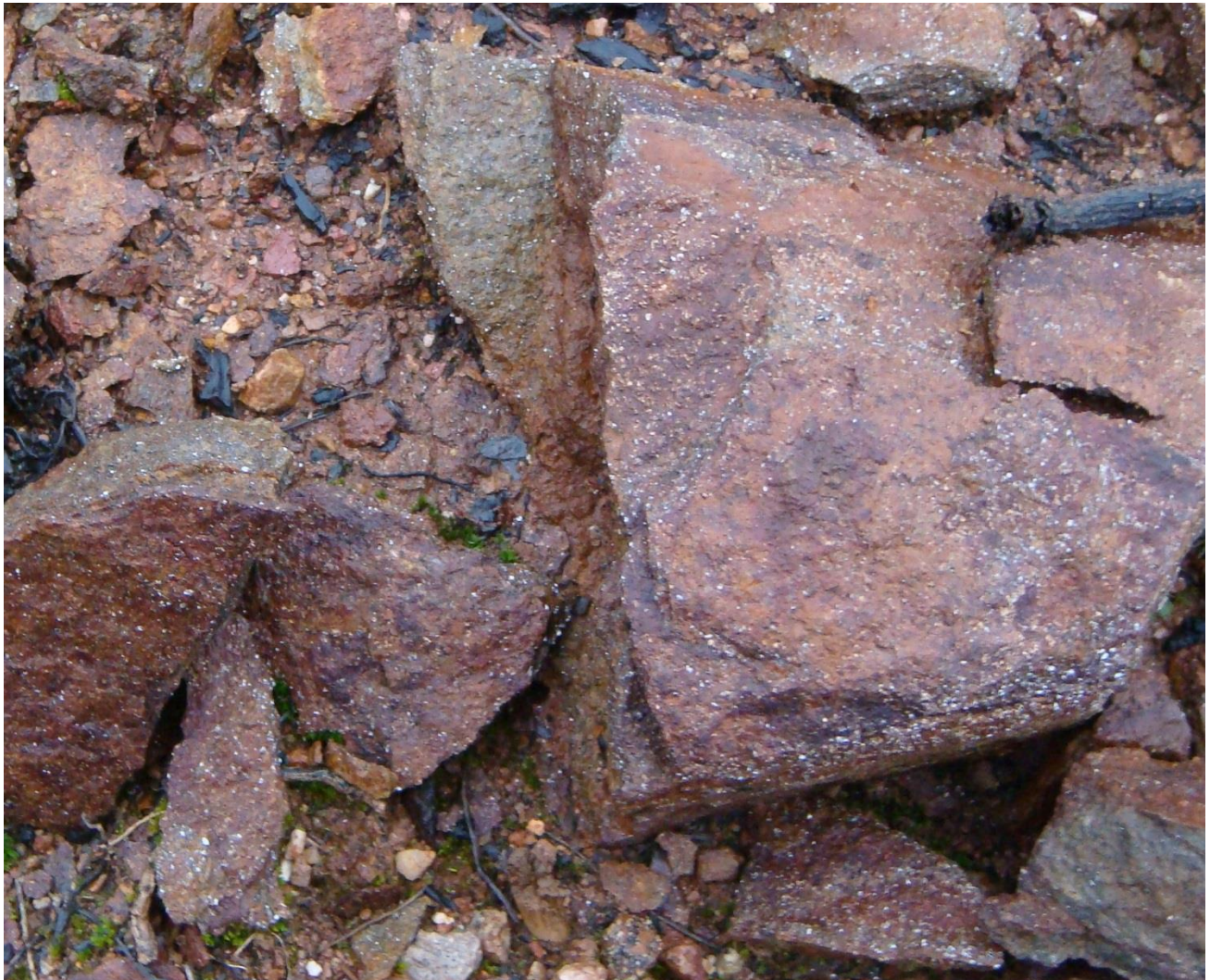
Close-up of Graphite bearing gneiss