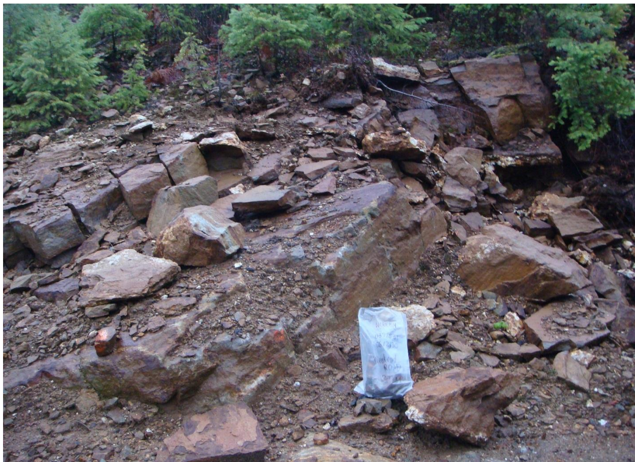
Flake Graphite in outcrop road cut – Carbon Queen property