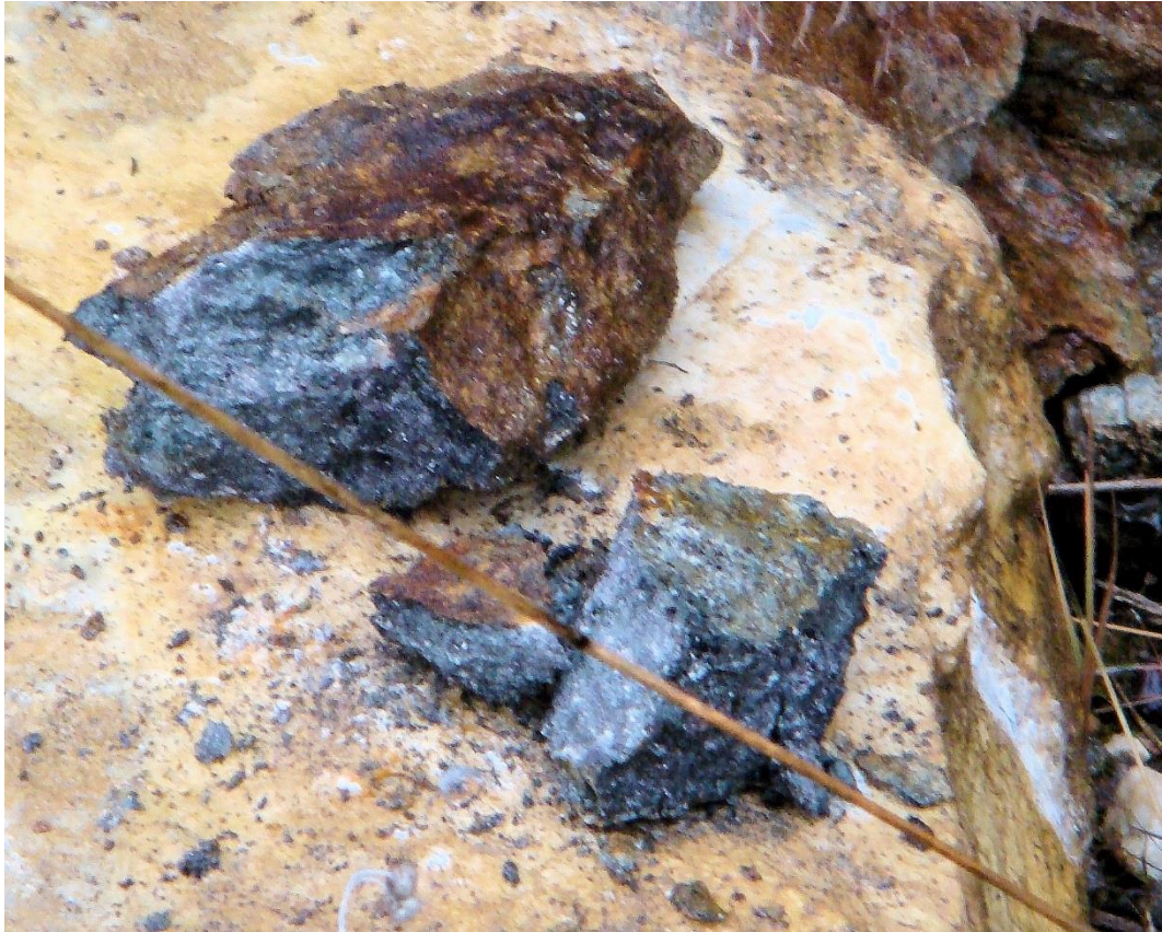
Massive Graphite – Carbon Queen

This property is offered for sale by way of working option to purchase.