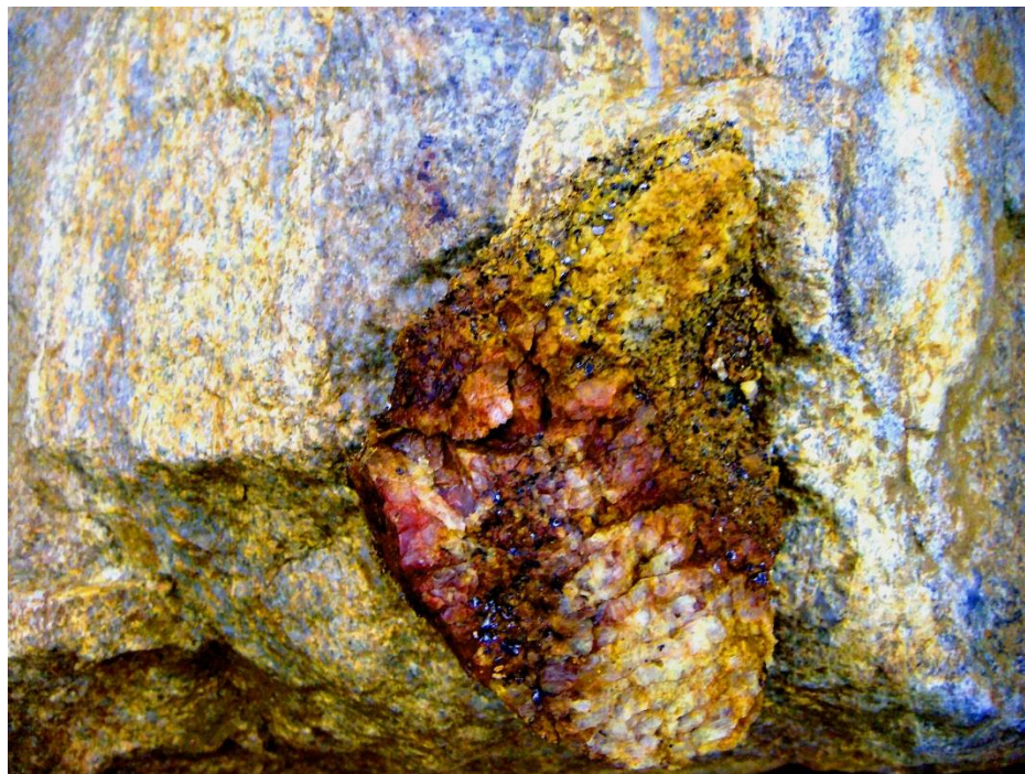
Abundant Flake Graphite also occurs in Pegmatite on the Carbon Queen (Dark blue bands and specks are graphite) Photo covers about 40cm